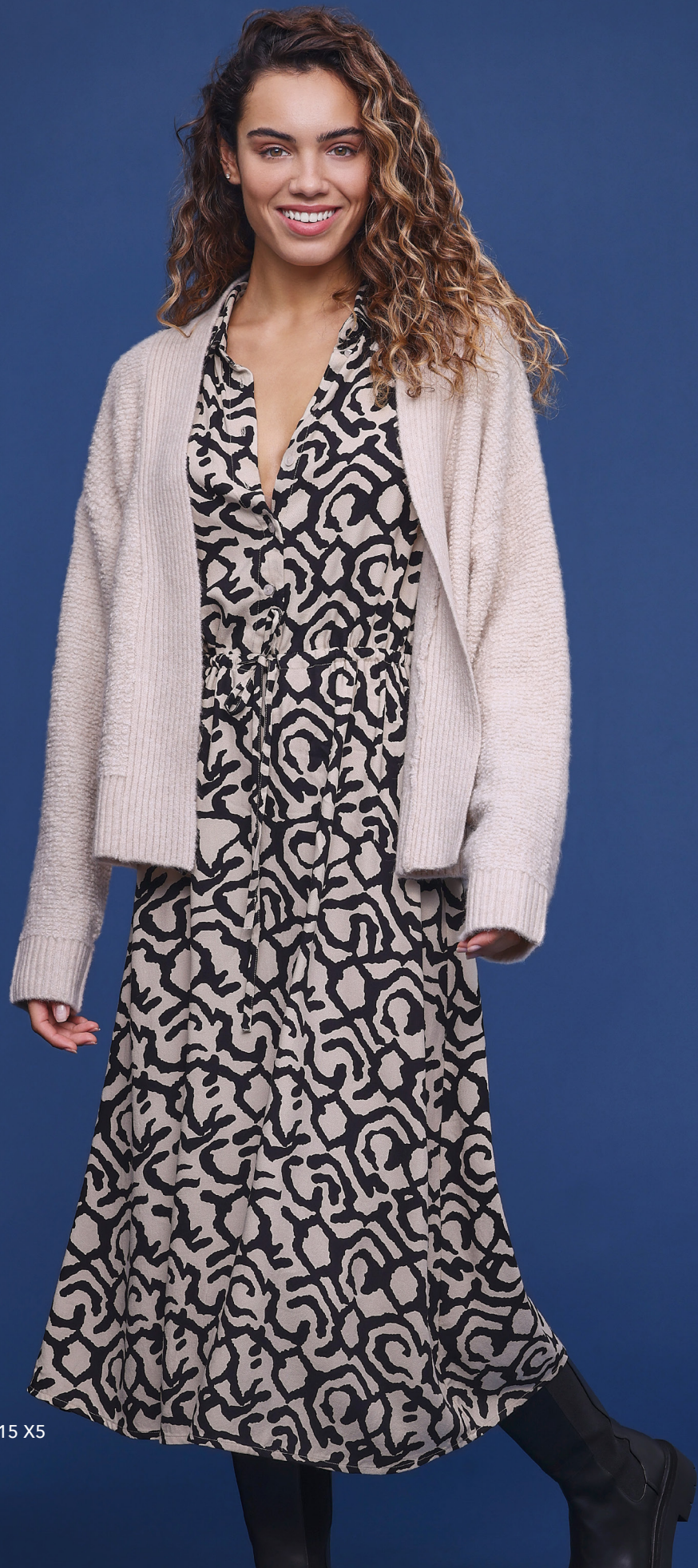
CARDIGAN . 248015 X5 DRESS . 284030 X