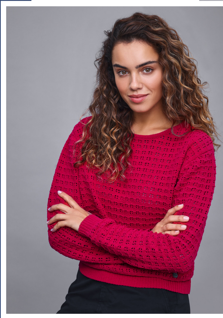
PULLOVER . 247963 X5 SKIRT . 282018 X