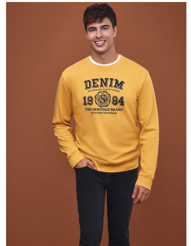
SWEATSHIRT . 370160 X5 T-SHIRT . 350508 X5 JEANS . 394510 X5