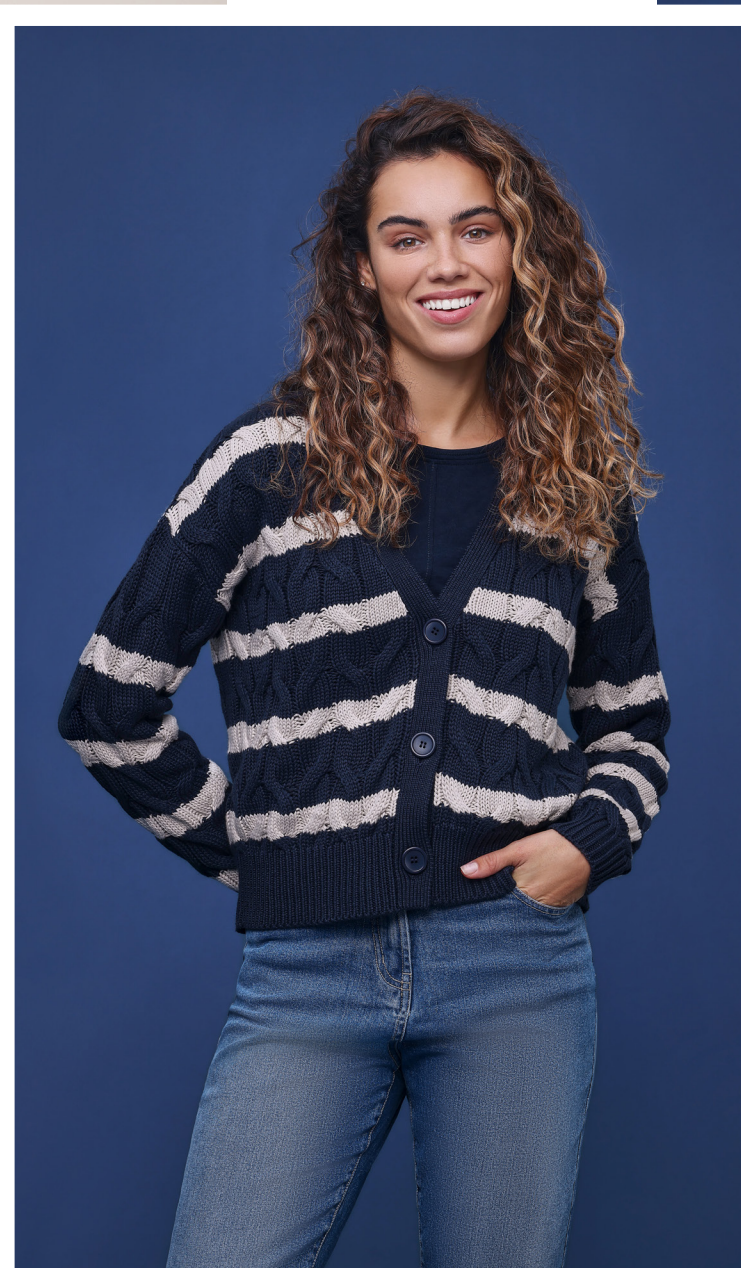
CARDIGAN . 247957 X T-SHIRT, LONGSLEEVE . 203527 X5 JEANS . 288019 X