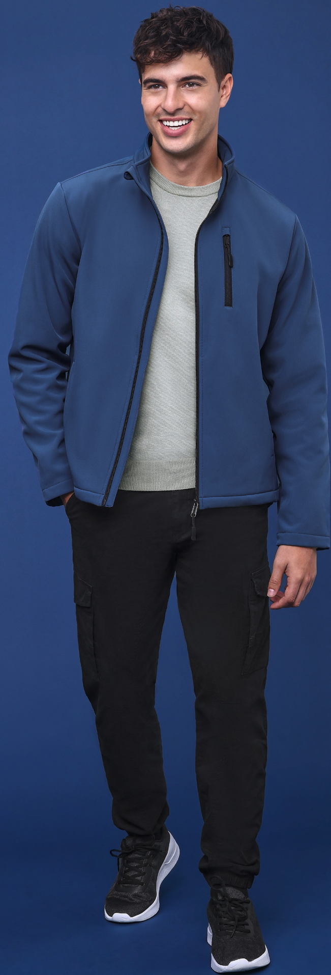
JACKET . 397033 X5 PULLOVER . 376449 X5 PANTS . 393009 X5