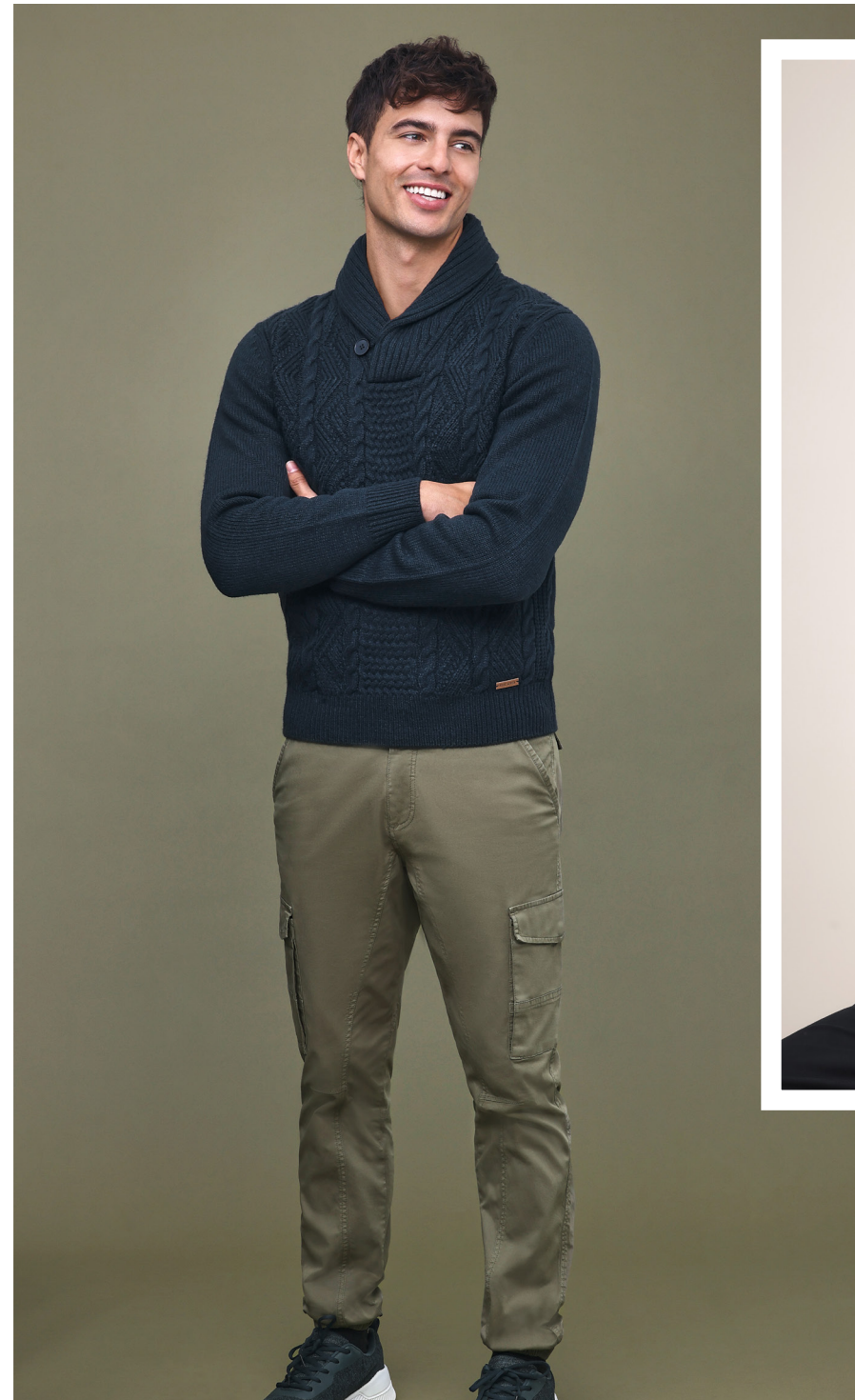
PULLOVER . 376443 X5 PANTS . 393009 X5