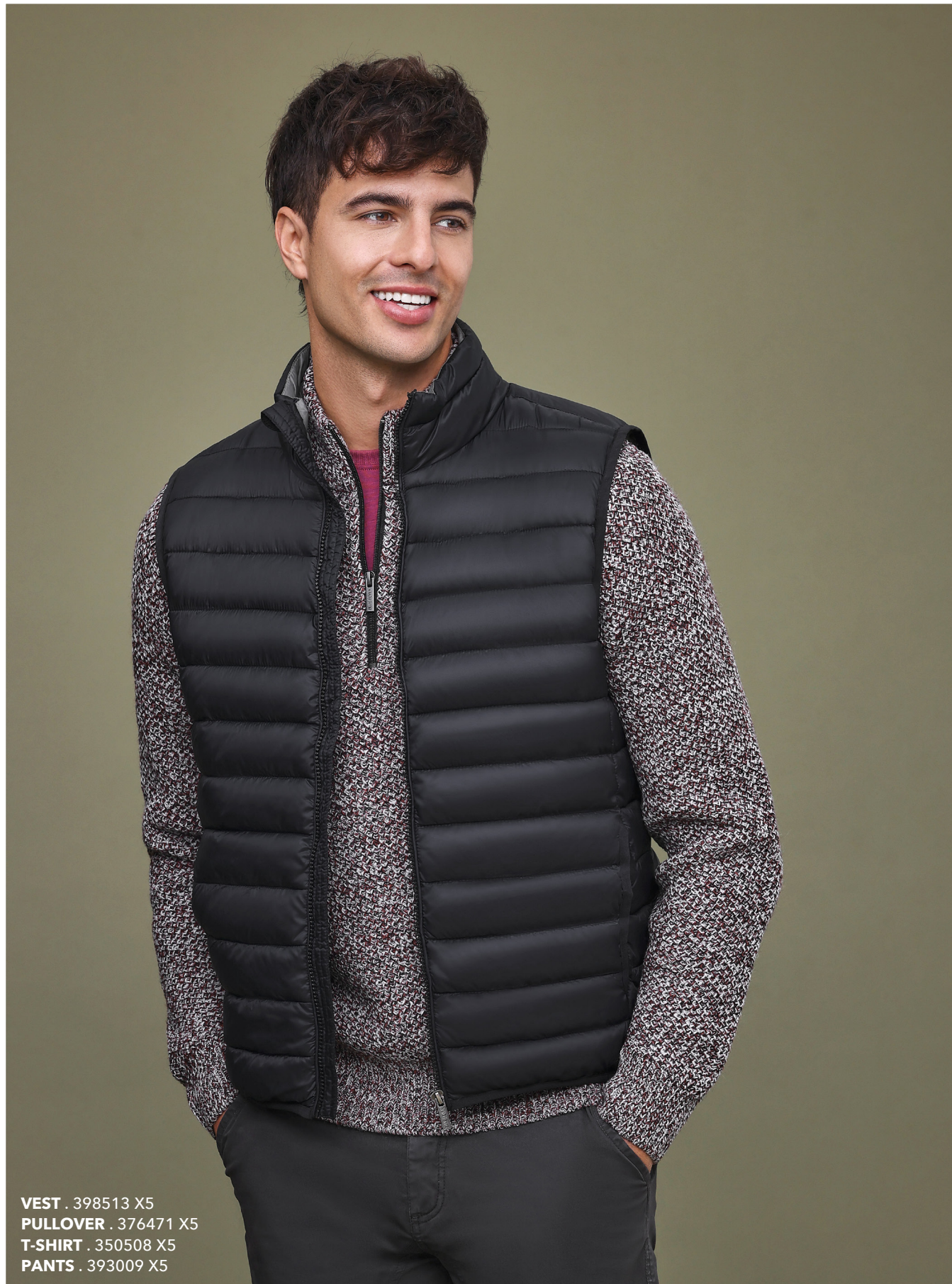
VEST . 398513 X5 PULLOVER . 376471 X5 T-SHIRT . 350508 X5 PANTS . 393009 X5

With a variety of new modern prints, scaled-back designs, and expanded offerings of shirts and knitwear, the collection offers a wide choice for every taste. The jacket range has also been expanded and now includes softshell jackets in two variants: sporty and classic. The new collection is characterized by its high-quality materials, including heavy as well as light qualities, to offer customers comfort and variations.