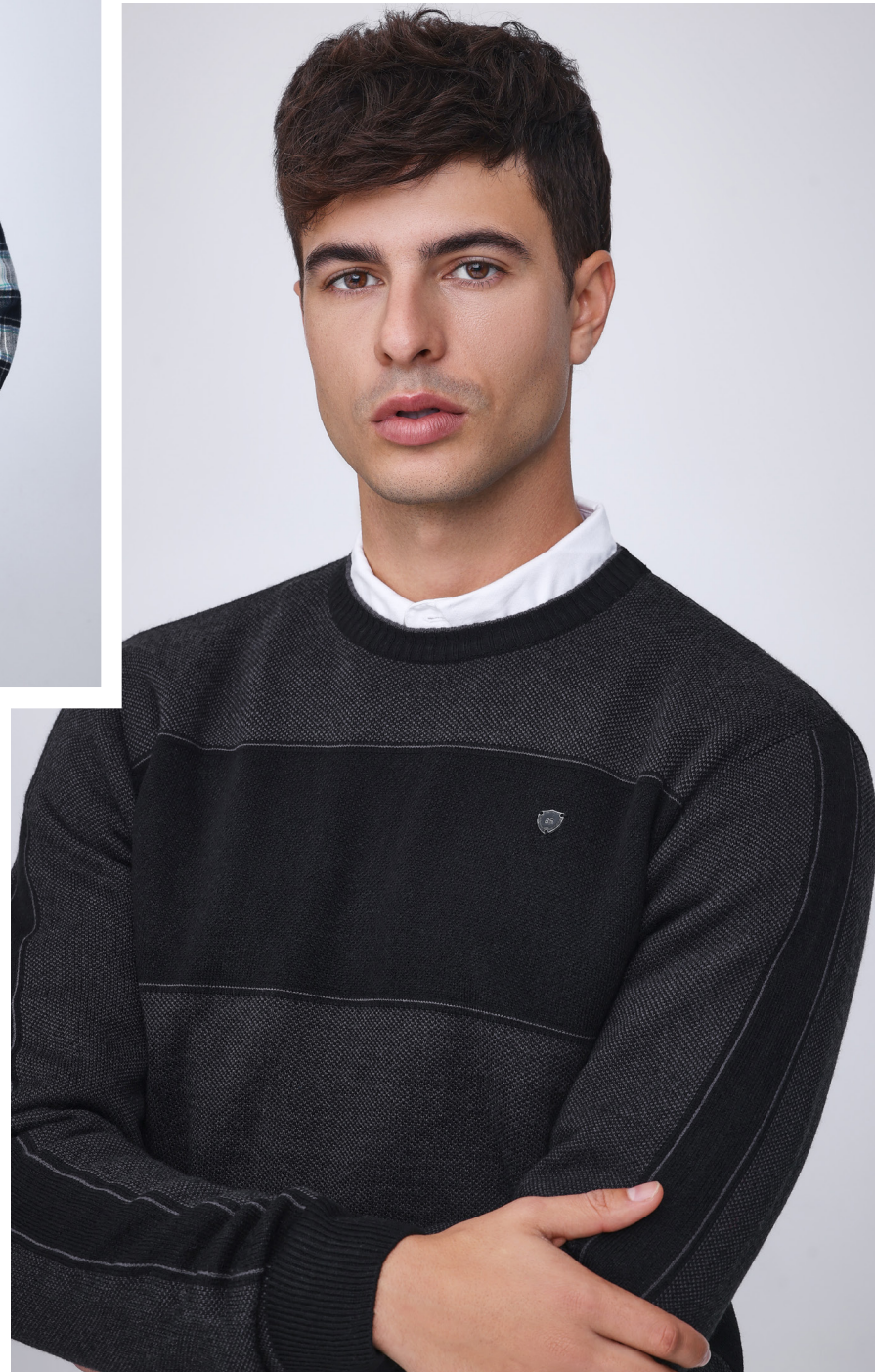
PULLOVER . 376469 X5 SHIRT . 390510 X5