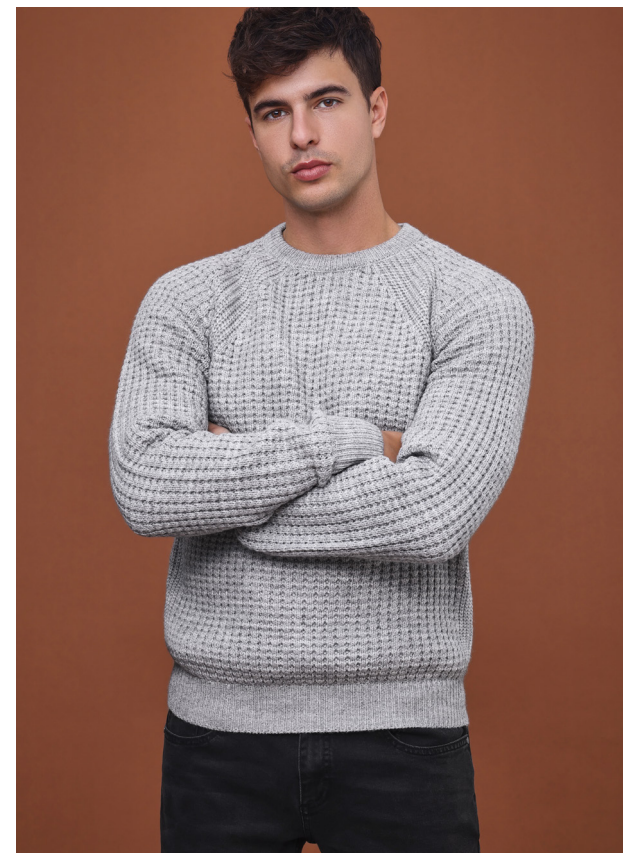
PULLOVER . 376446 X5 / JEANS . 394510 X5