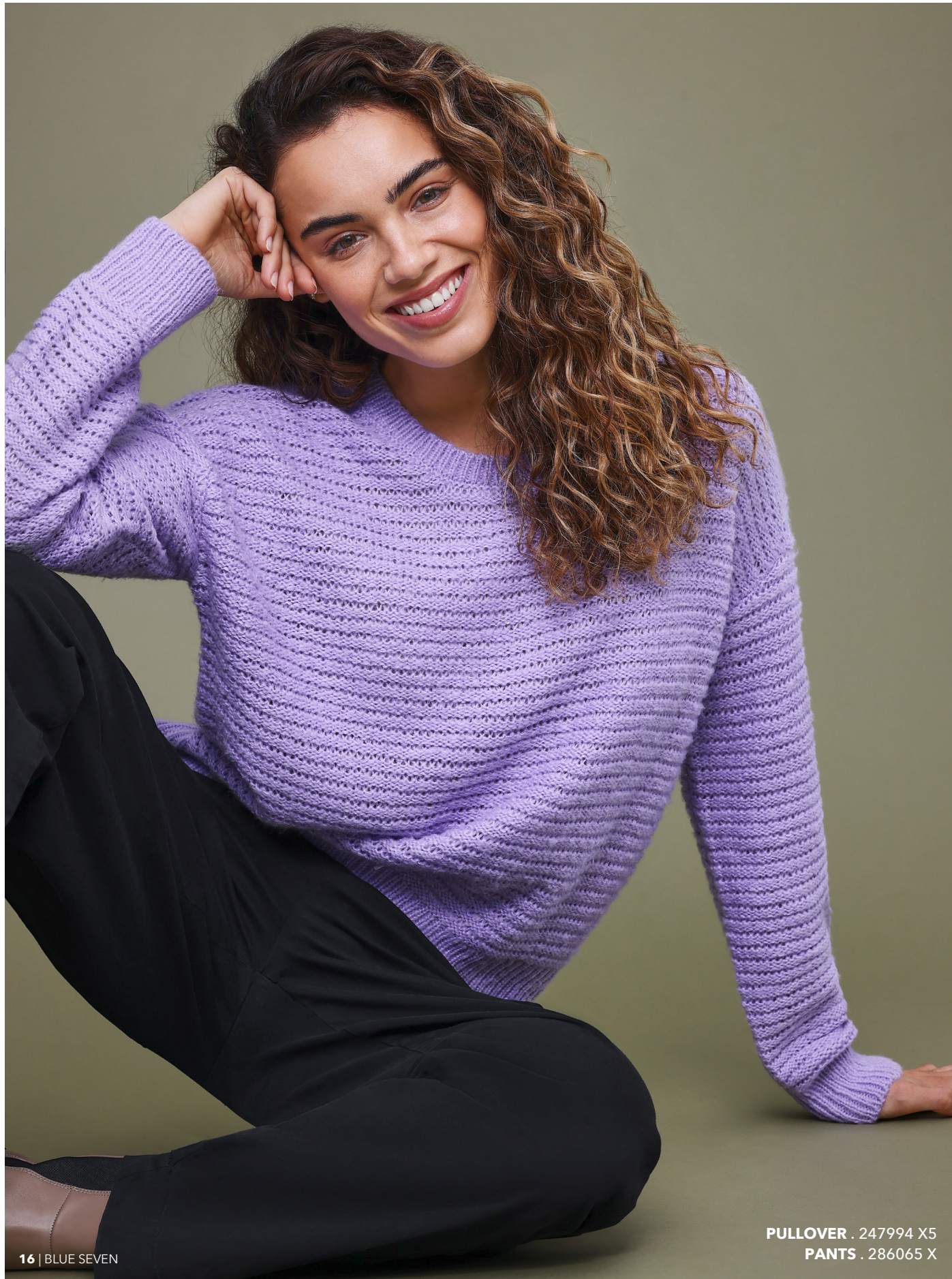
PULLOVER . 247994 X5 PANTS . 286065 X