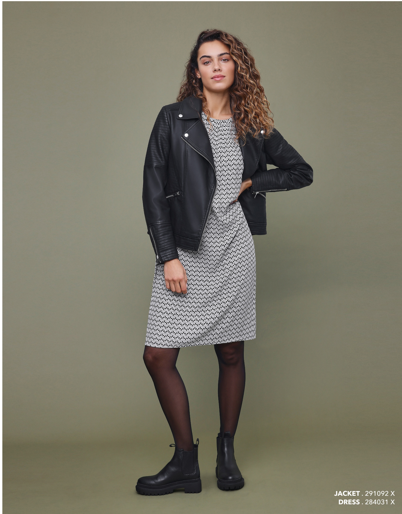
JACKET . 291092 X DRESS . 284031 X