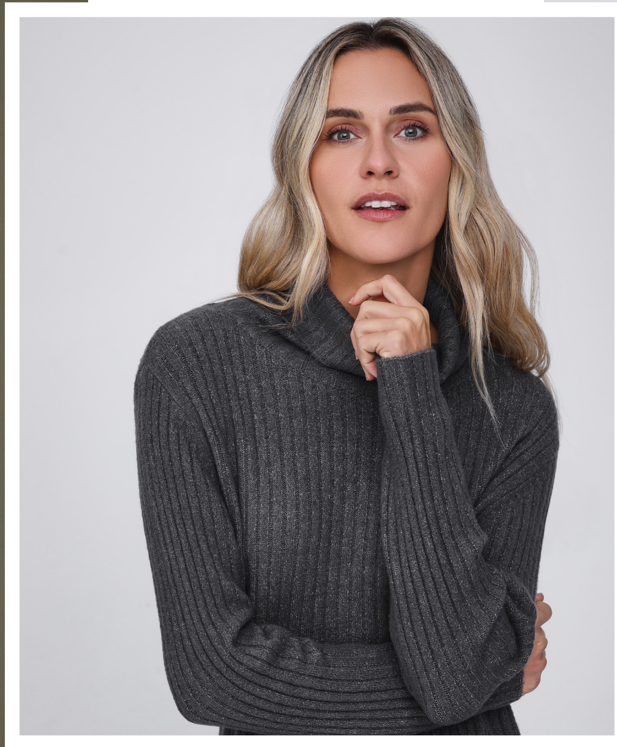
DRESS . 257105 X