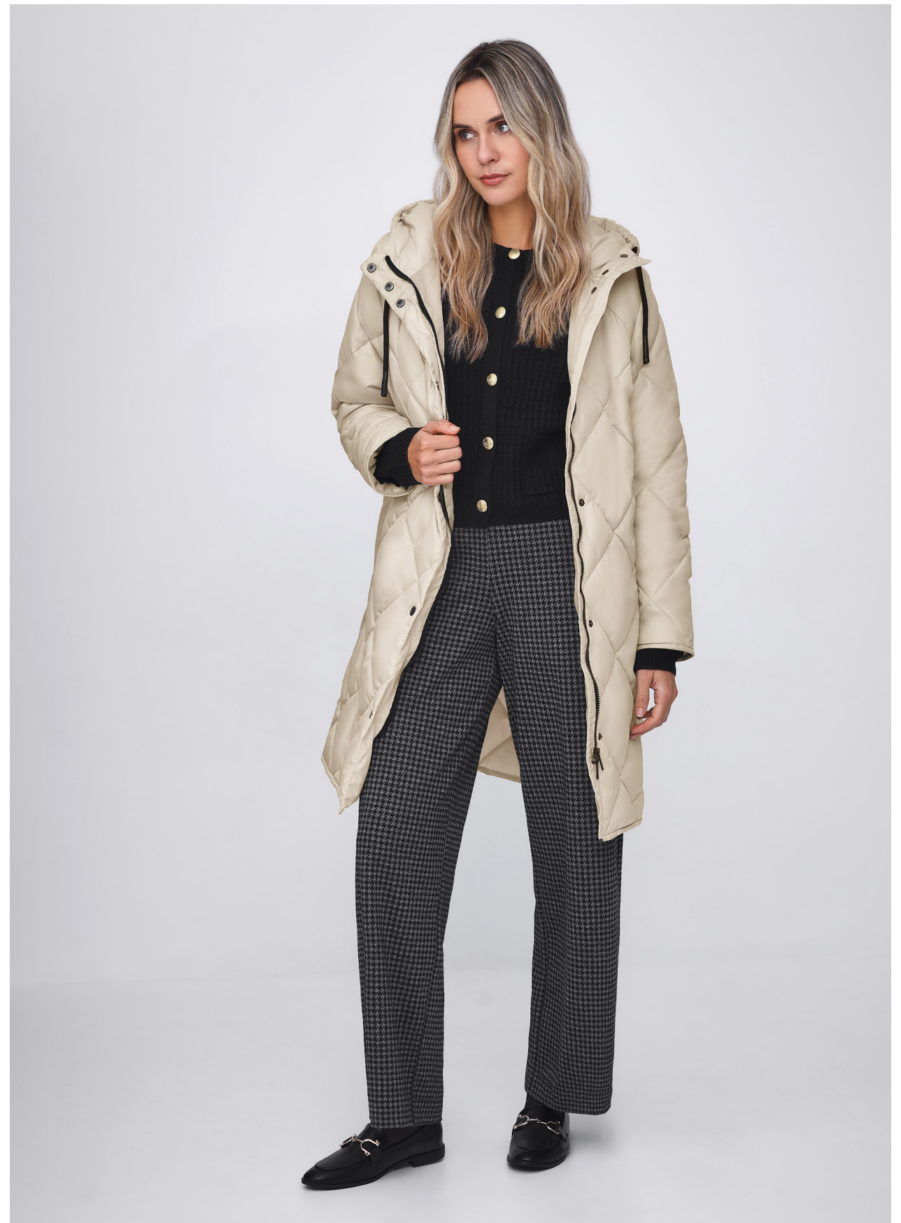
COAT . 291088 X5 CARDIGAN . 247950 X PANTS . 286062 X5