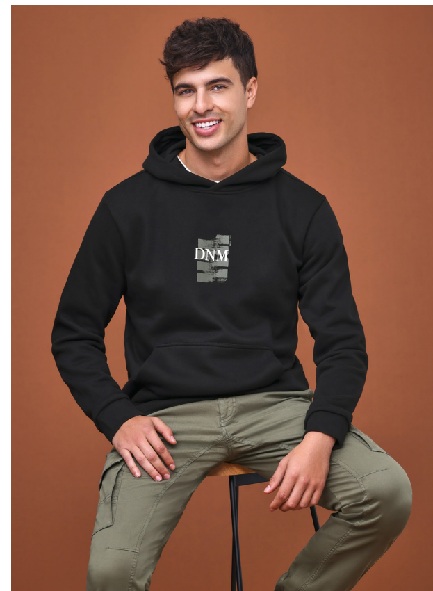
HOODIE . 370178 X5 PANTS . 393009 X5