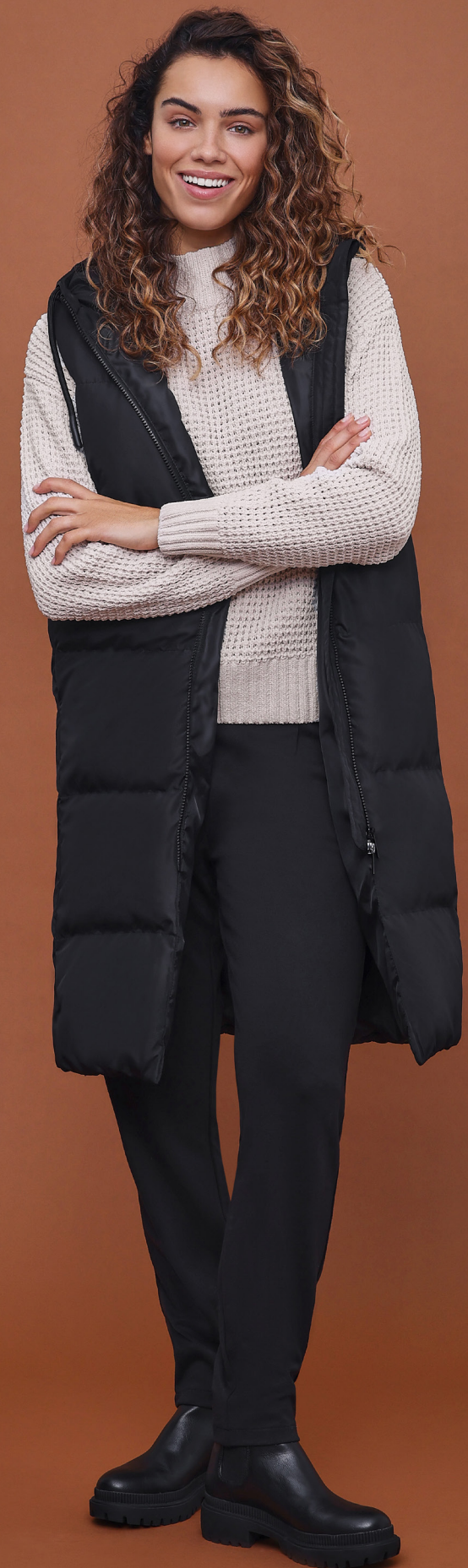
VEST . 293020 X5 PULLOVER . 247965 X5 PANTS . 286065 X