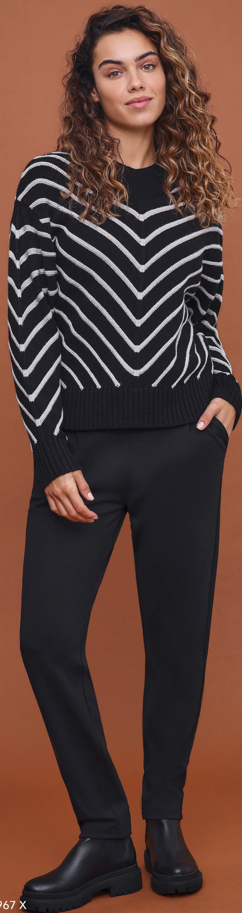
PULLOVER . 247967 X PANTS . 286065 X