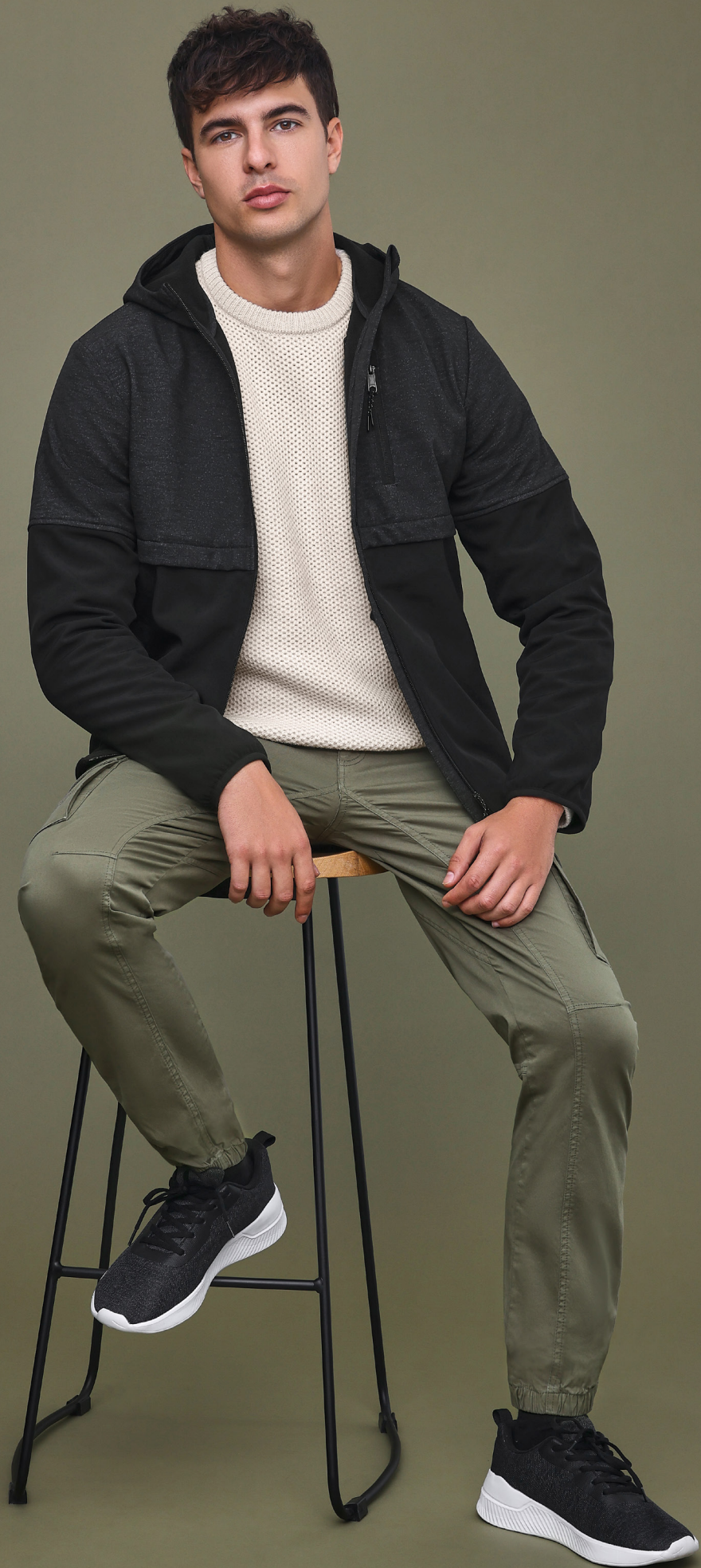
JACKET . 397032 X5 PULLOVER . 376455 X5 PANTS . 393009 X5