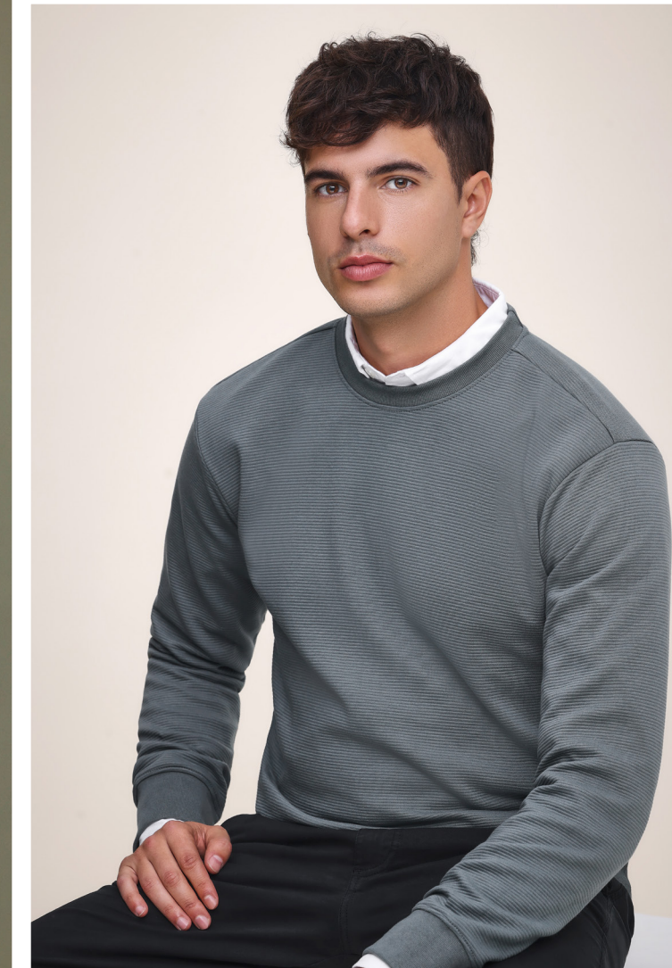
SWEATSHIRT . 370174 X5 SHIRT . 390510 X5 PANTS . 393010 X5