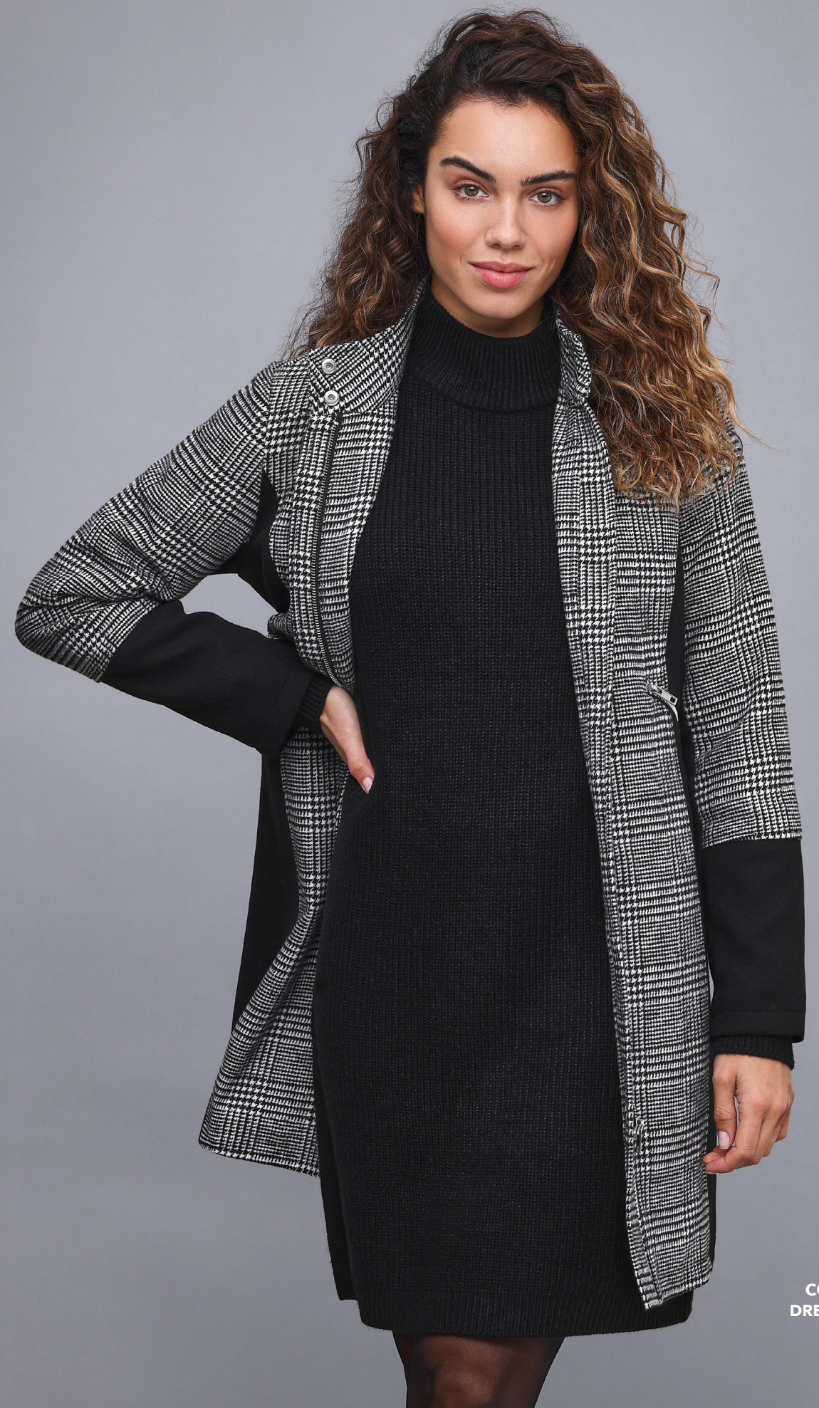
COAT . 291093 X DRESS . 257108 X5