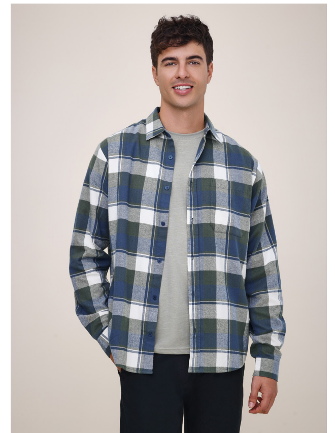
WOVEN SHIRT . 390514 X5 / T-SHIRT . 350508 X5 PANTS . 393010 X5