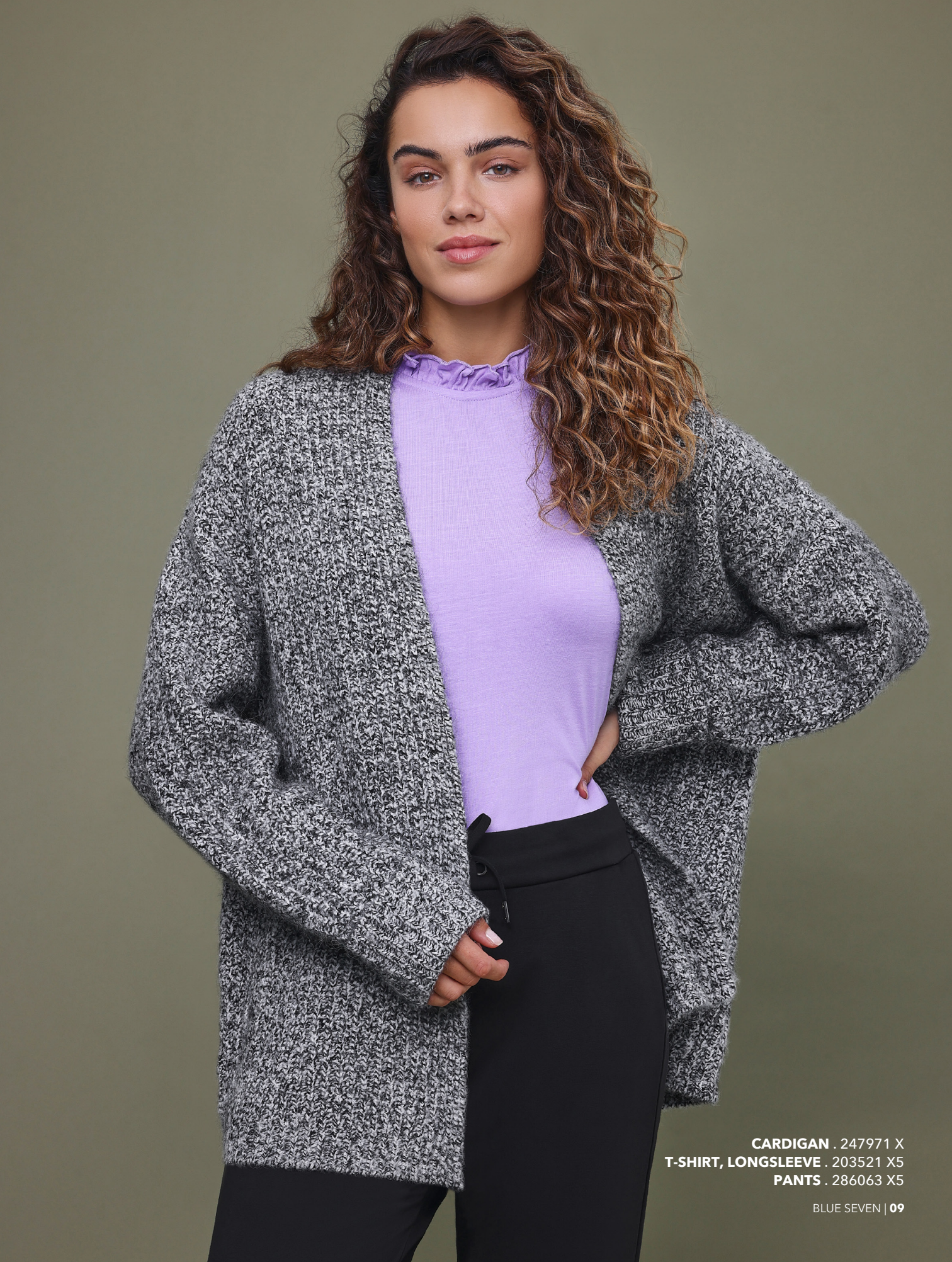
CARDIGAN . 247971 X T-SHIRT, LONGSLEEVE . 203521 X5 PANTS . 286063 X5