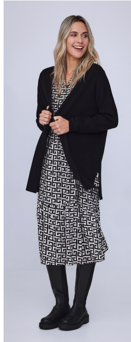
CARDIGAN . 248007 X5 DRESS . 284029 X