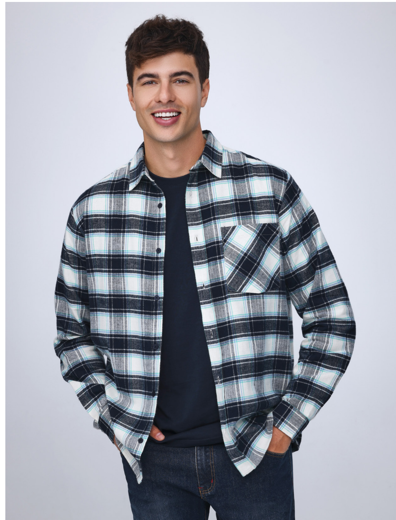
WOVEN SHIRT . 390519 X5 T-SHIRT . 350508 X5 JEANS . 394510 X5