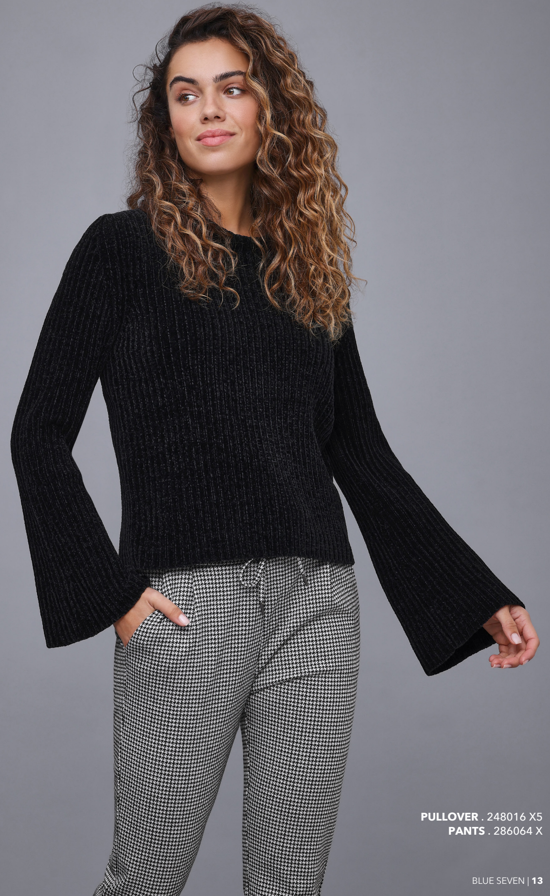
PULLOVER . 248016 X5 PANTS . 286064 X