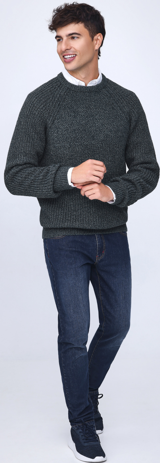
PULLOVER . 376444 X5 SHIRT . 3390510 X5 PANTS . 394510 X5