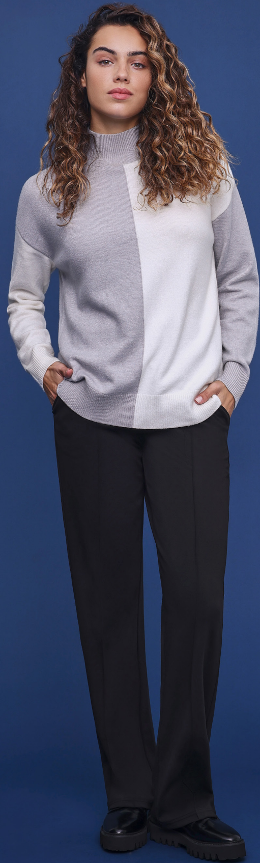
PULLOVER . 247996 X PANTS . 286066 X