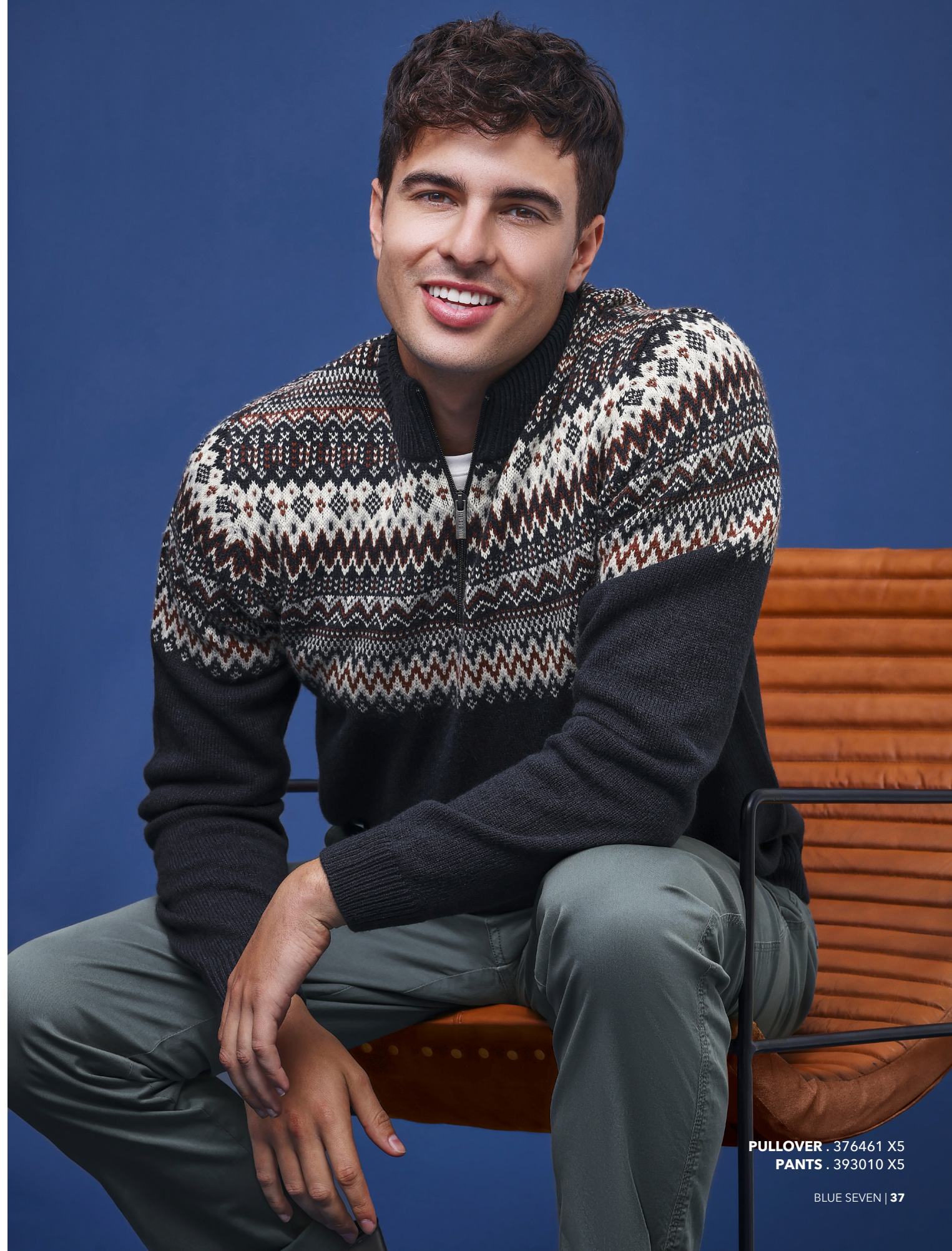
PULLOVER . 376461 X5 PANTS . 393010 X5