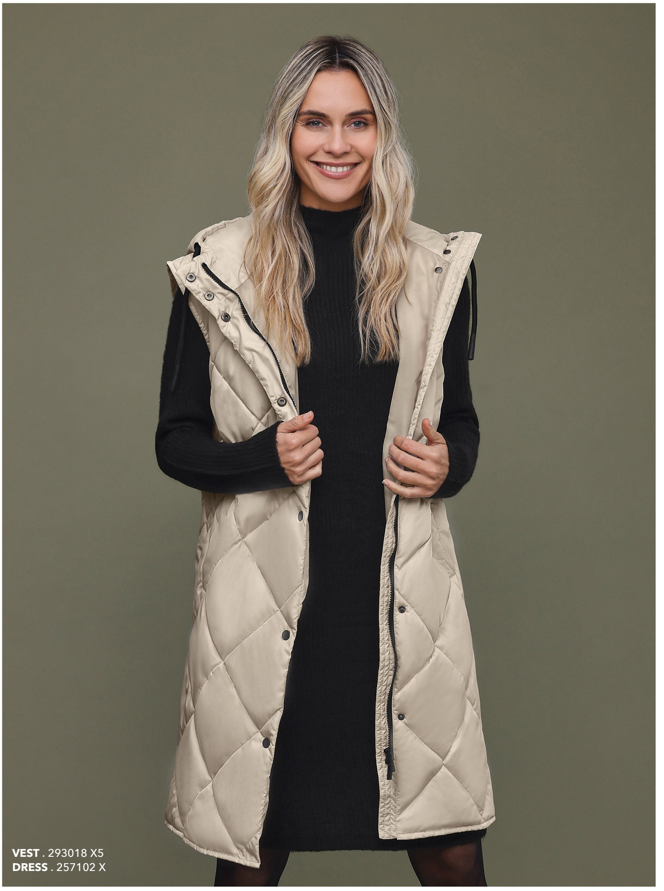
VEST . 293018 X5 DRESS . 257102 X