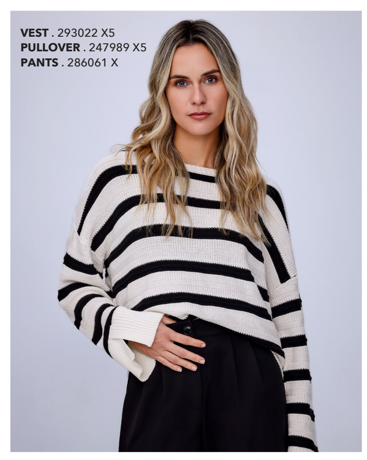
VEST . 293022 X5 PULLOVER . 247989 X5 PANTS . 286061 X