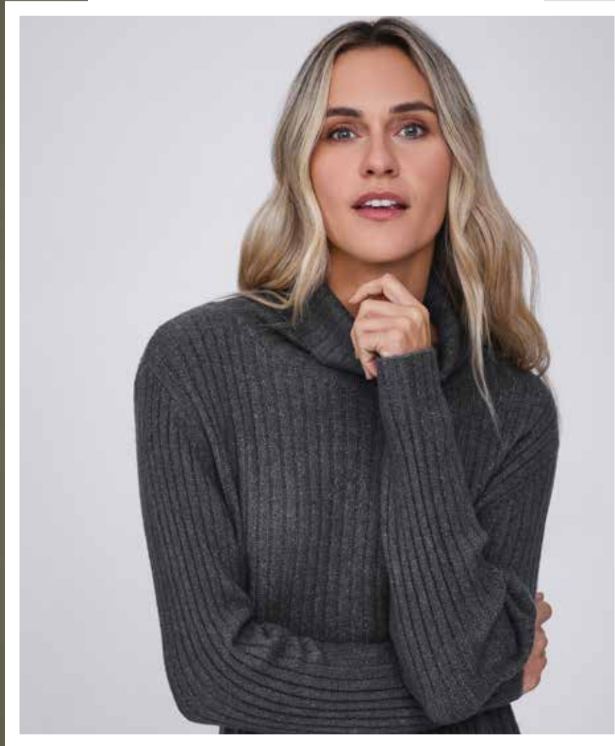
DRESS . 257105 X