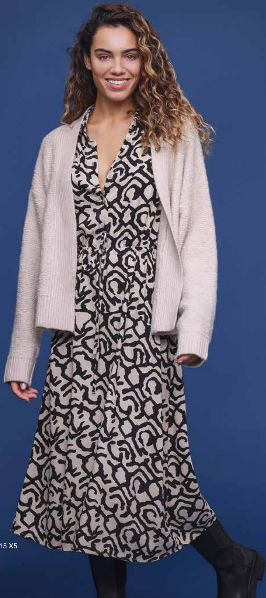
CARDIGAN . 248015 X5 DRESS . 284030 X