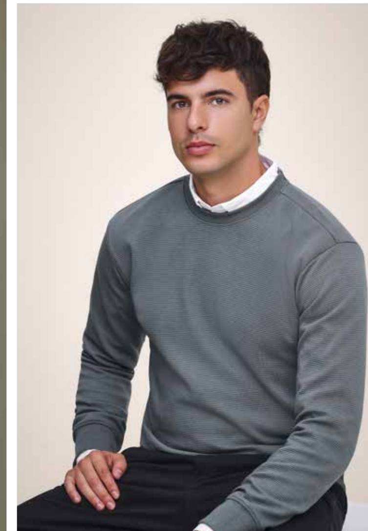
SWEATSHIRT . 370174 X5 SHIRT . 390510 X5 PANTS . 393010 X5