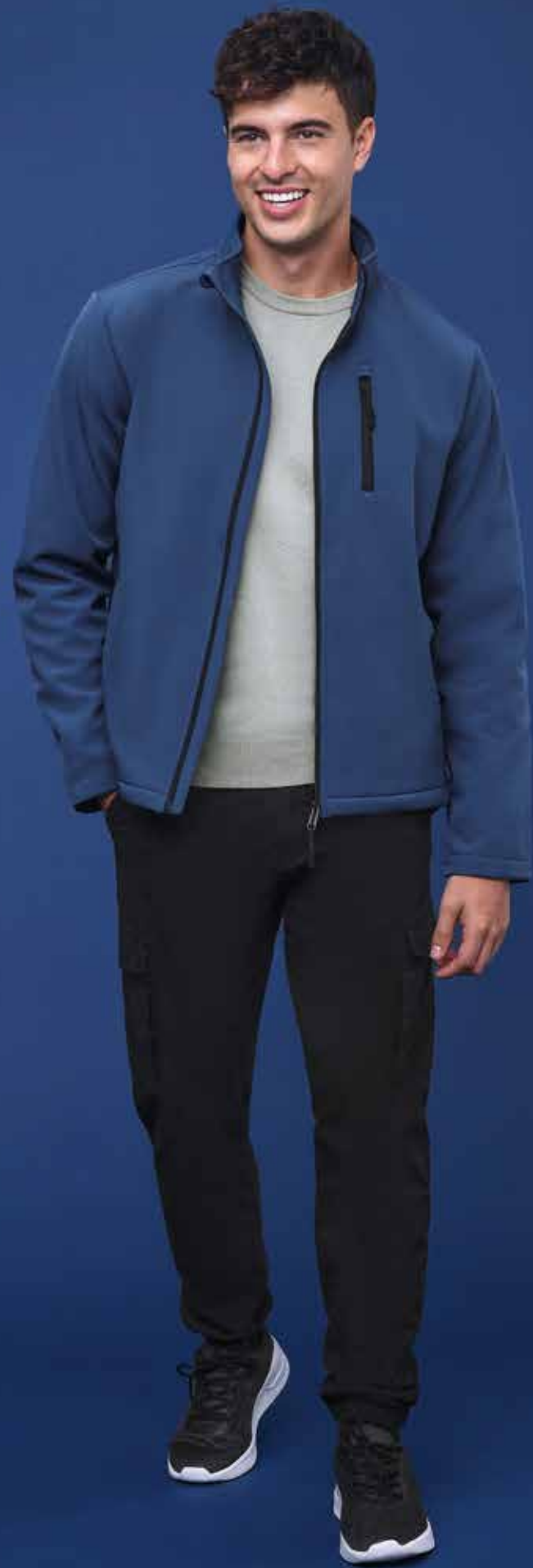
JACKET . 397033 X5 PULLOVER . 376449 X5 PANTS . 393009 X5