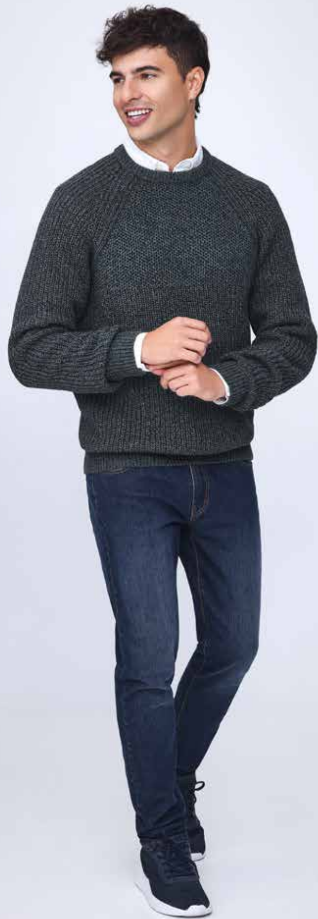
PULLOVER . 376444 X5 SHIRT . 3390510 X5 PANTS . 394510 X5