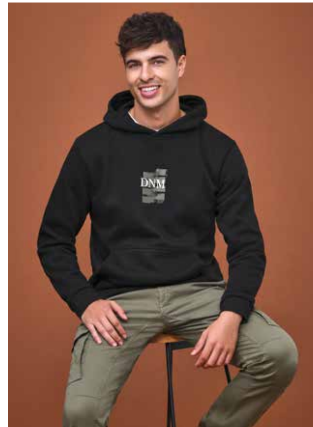
HOODIE . 370178 X5 PANTS . 393009 X5