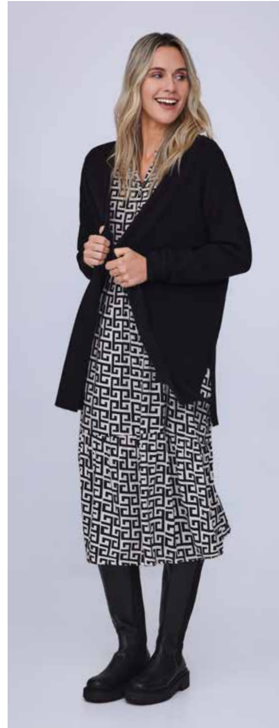
CARDIGAN . 248007 X5 DRESS . 284029 X