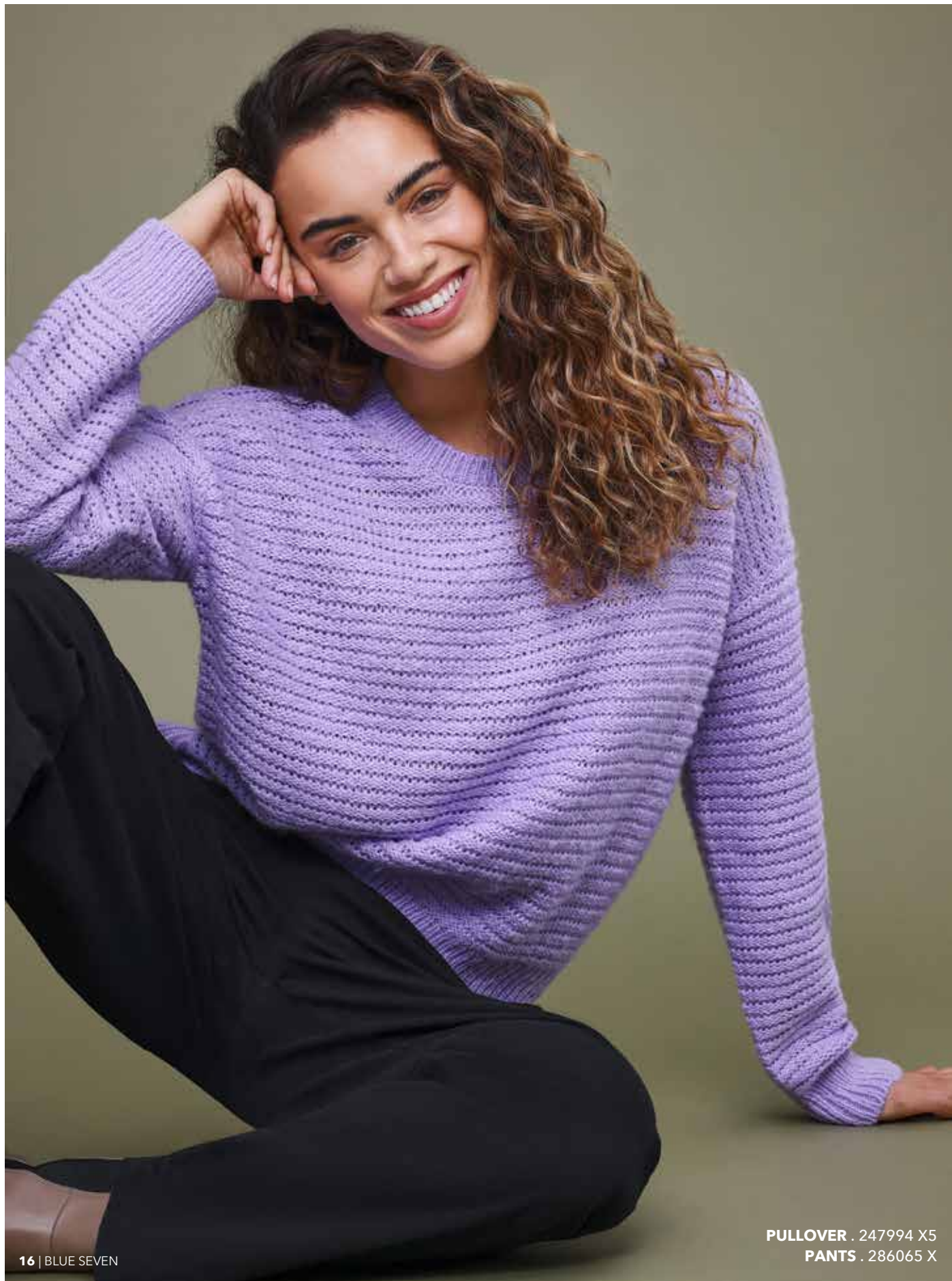
PULLOVER . 247994 X5 PANTS . 286065 X