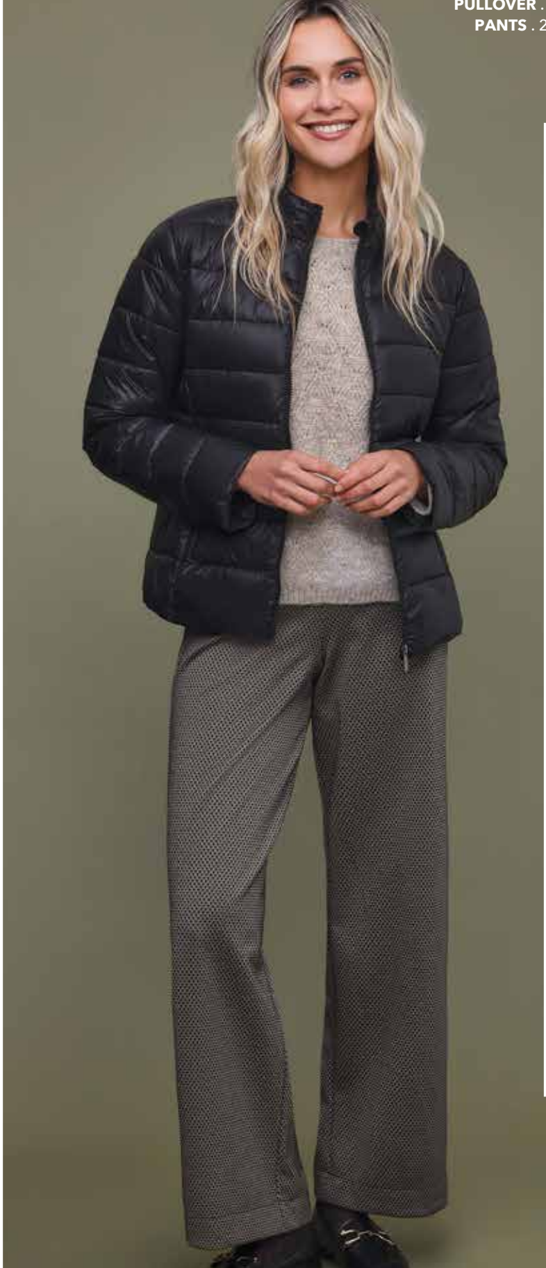
JACKET . 291089 X PULLOVER . 247943 X PANTS . 286062 X5