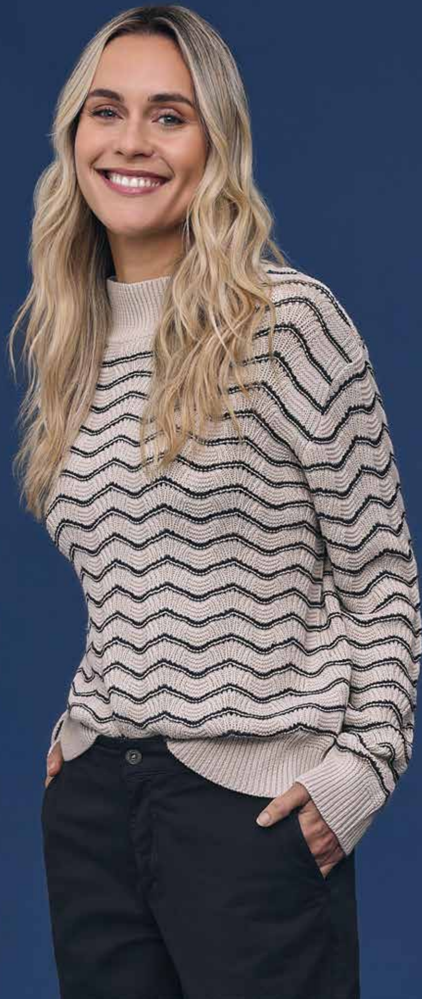
PULLOVER . 247977 X5 PANTS . 286060 X5