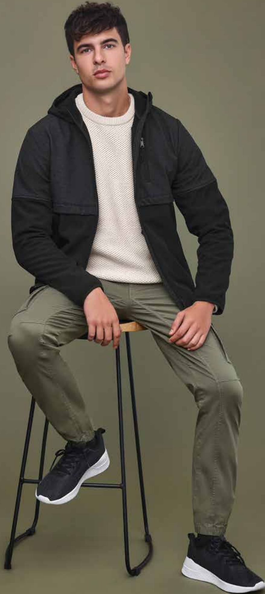
JACKET . 397032 X5 PULLOVER . 376455 X5 PANTS . 393009 X5