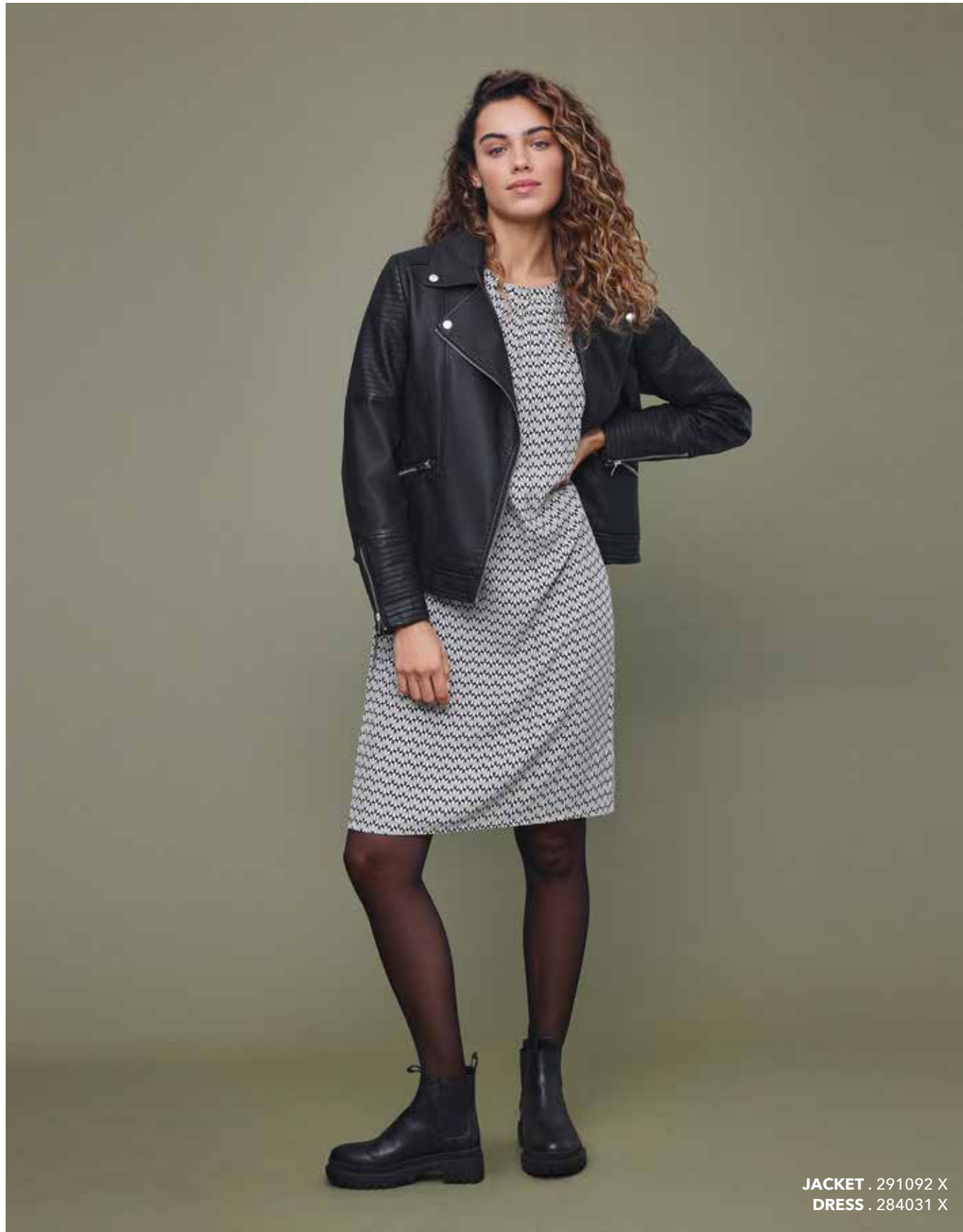
JACKET . 291092 X DRESS . 284031 X