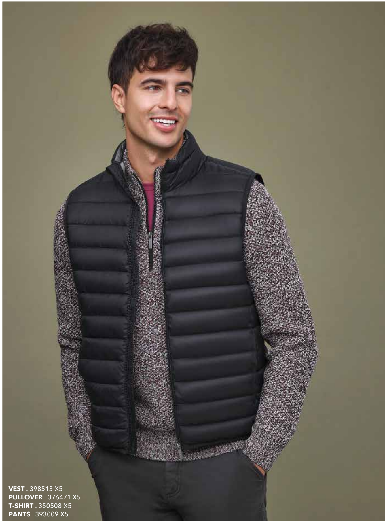
VEST . 398513 X5 PULLOVER . 376471 X5 T-SHIRT . 350508 X5 PANTS . 393009 X5

With a variety of new modern prints, scaled-back designs, and expanded offerings of shirts and knitwear, the collection offers a wide choice for every taste. The jacket range has also been expanded and now includes softshell jackets in two variants: sporty and classic. The new collection is characterized by its high-quality materials, including heavy as well as light qualities, to offer customers comfort and variations.