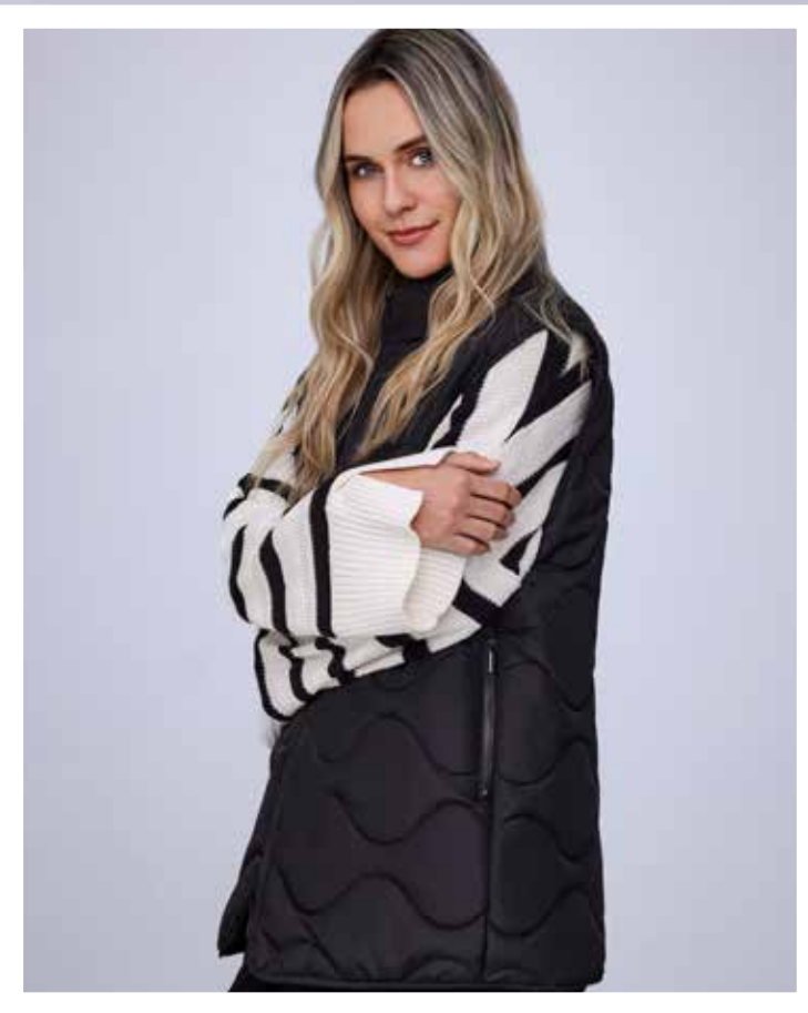
VEST . 293022 X5 PULLOVER . 247989 X5 PANTS . 286061 X