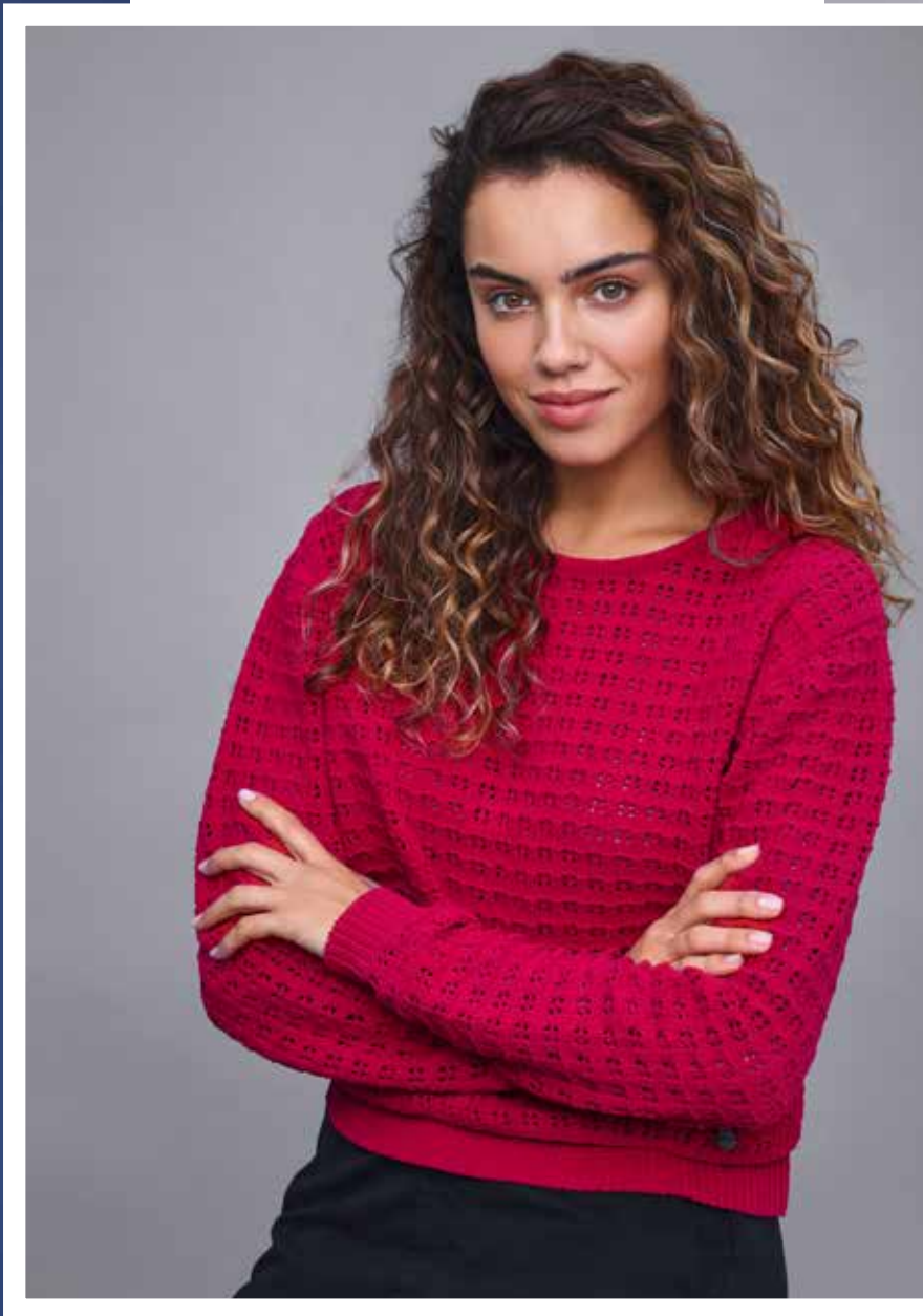
PULLOVER . 247963 X5 SKIRT . 282018 X