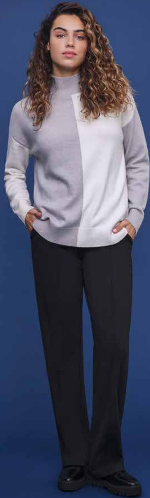
PULLOVER . 247996 X PANTS . 286066 X