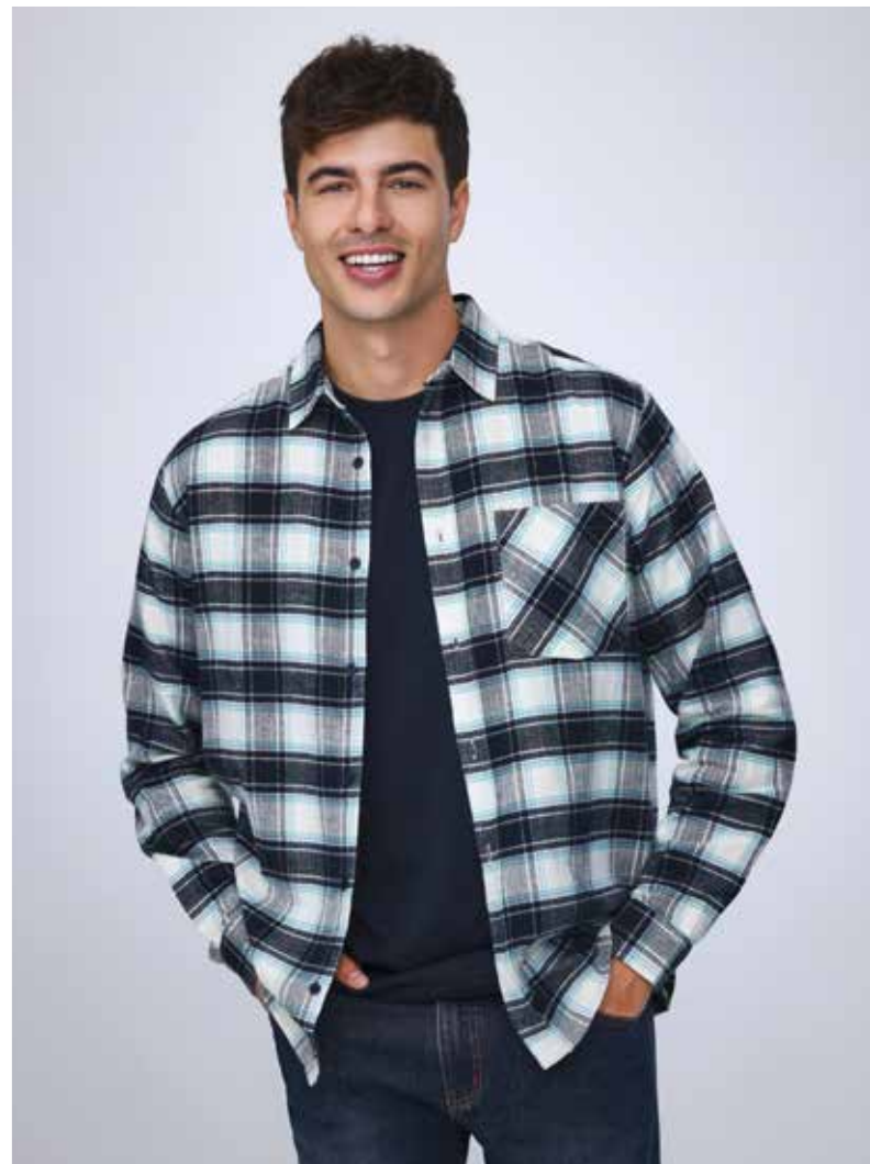
WOVEN SHIRT . 390519 X5 T-SHIRT . 350508 X5 JEANS . 394510 X5