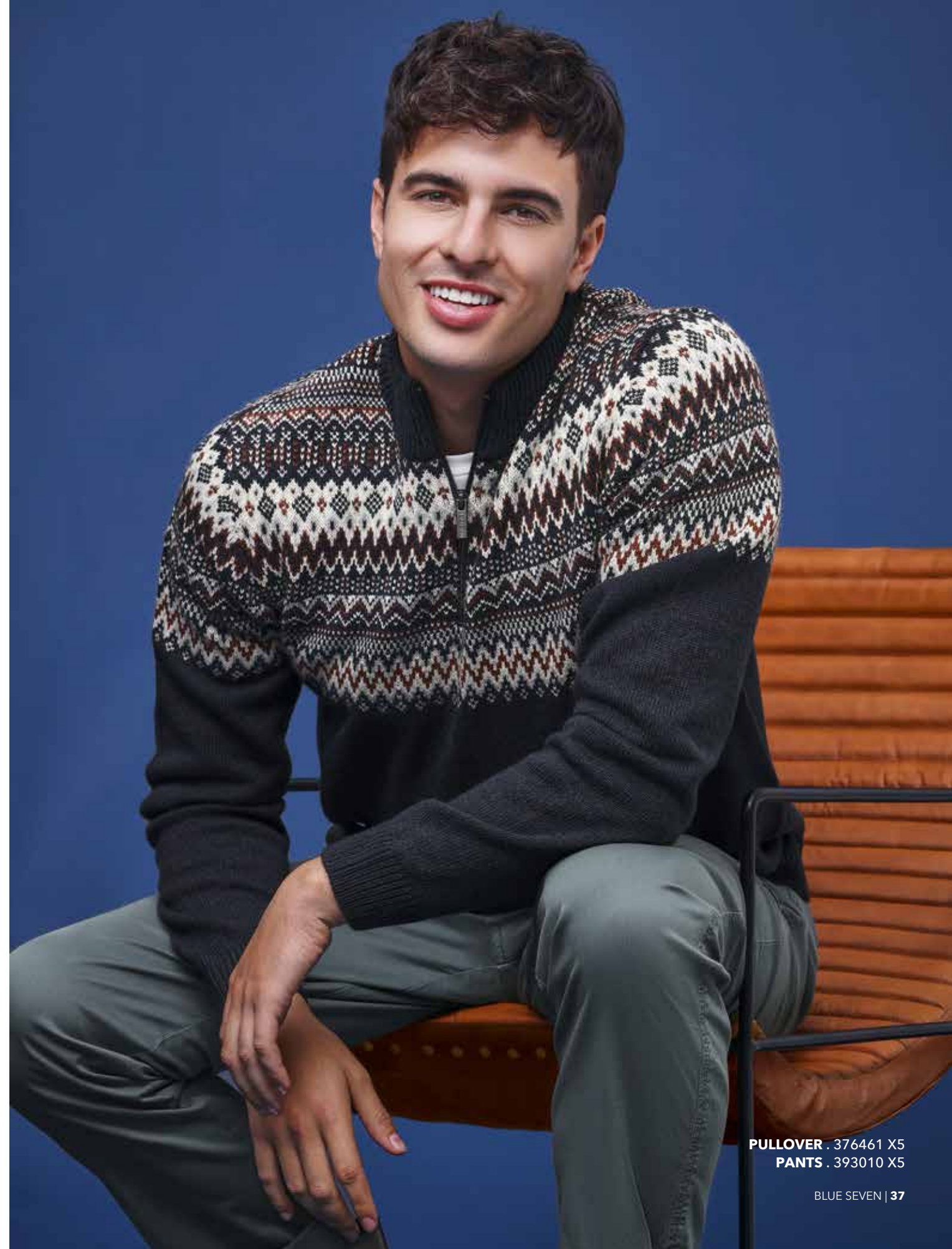
PULLOVER . 376461 X5 PANTS . 393010 X5