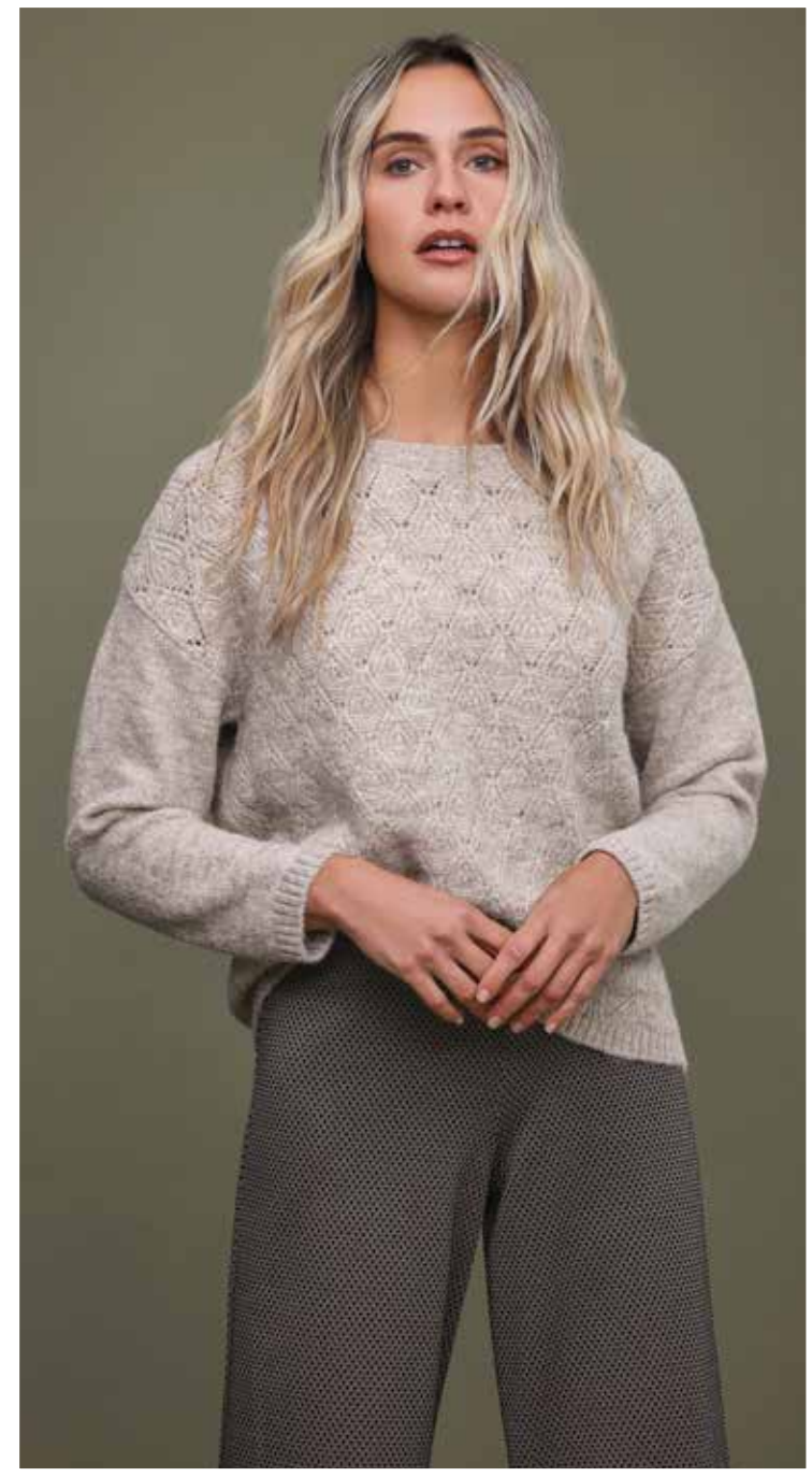
PULLOVER . 247943 X PANTS . 286062 X5