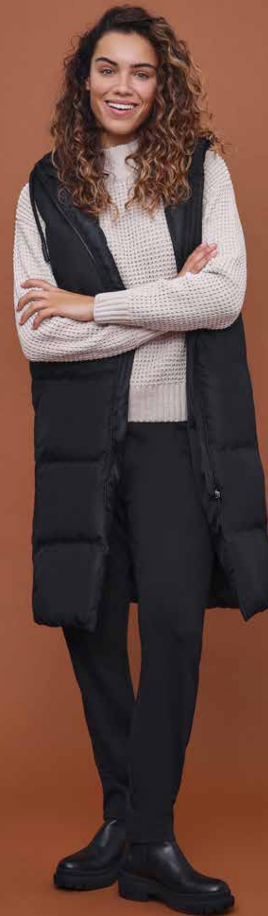
PULLOVER . 247967 X PANTS . 286065 X