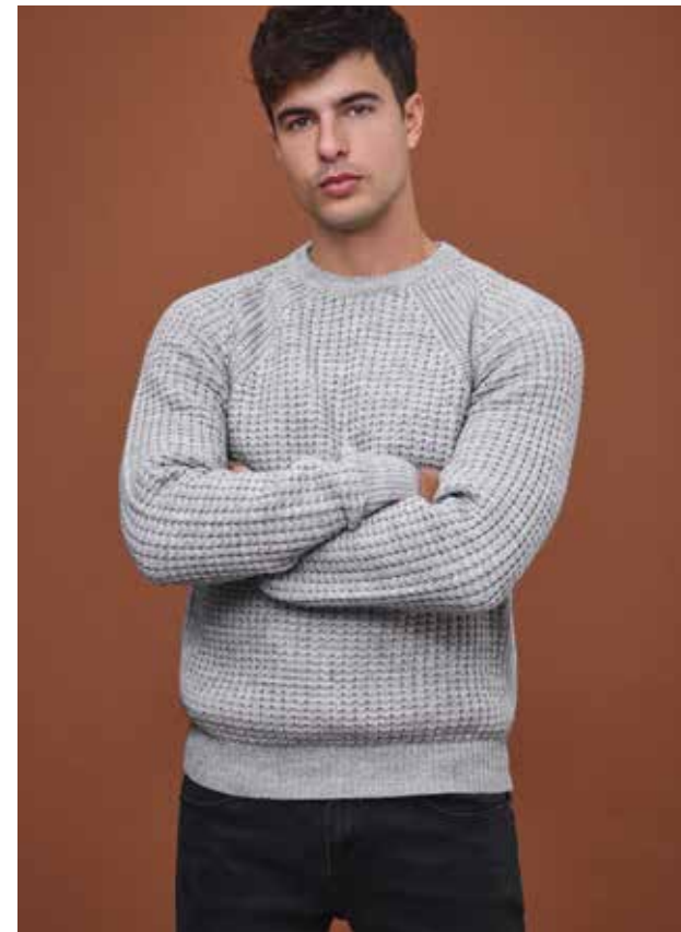
PULLOVER . 376446 X5 / JEANS . 394510 X5