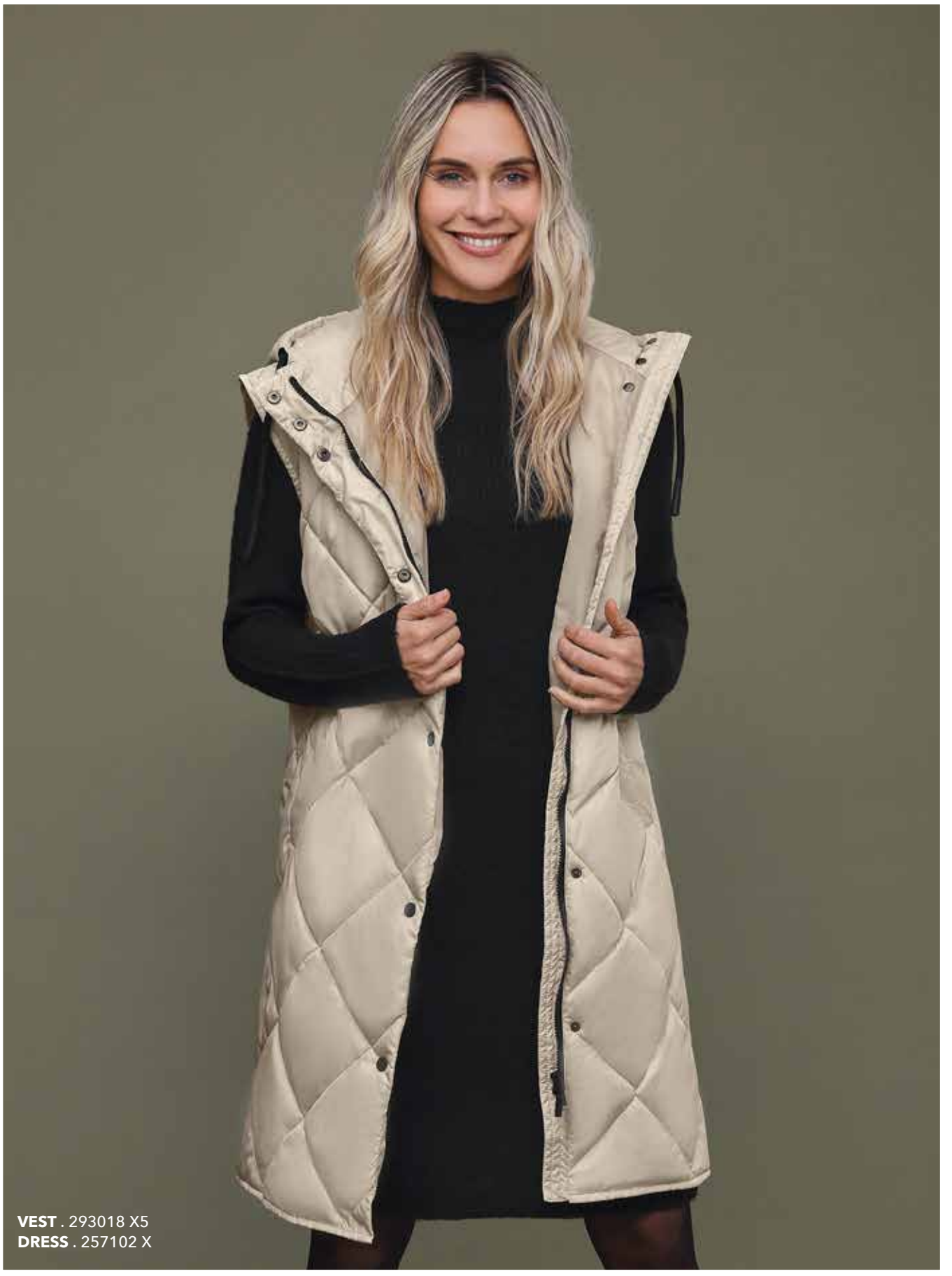
VEST . 293018 X5 DRESS . 257102 X