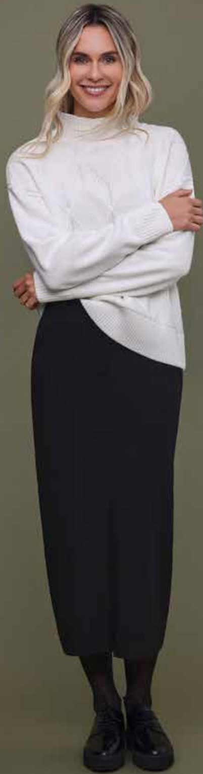
PULLOVER . 247975 X5 SKIRT . 282017 X