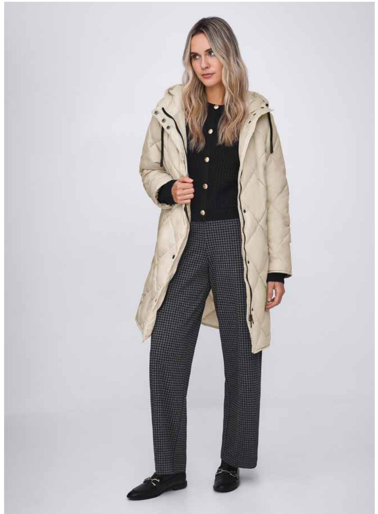
COAT . 291088 X5 CARDIGAN . 247950 X PANTS . 286062 X5