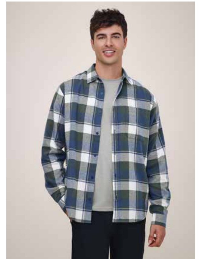
WOVEN SHIRT . 390514 X5 / T-SHIRT . 350508 X5 PANTS . 393010 X5