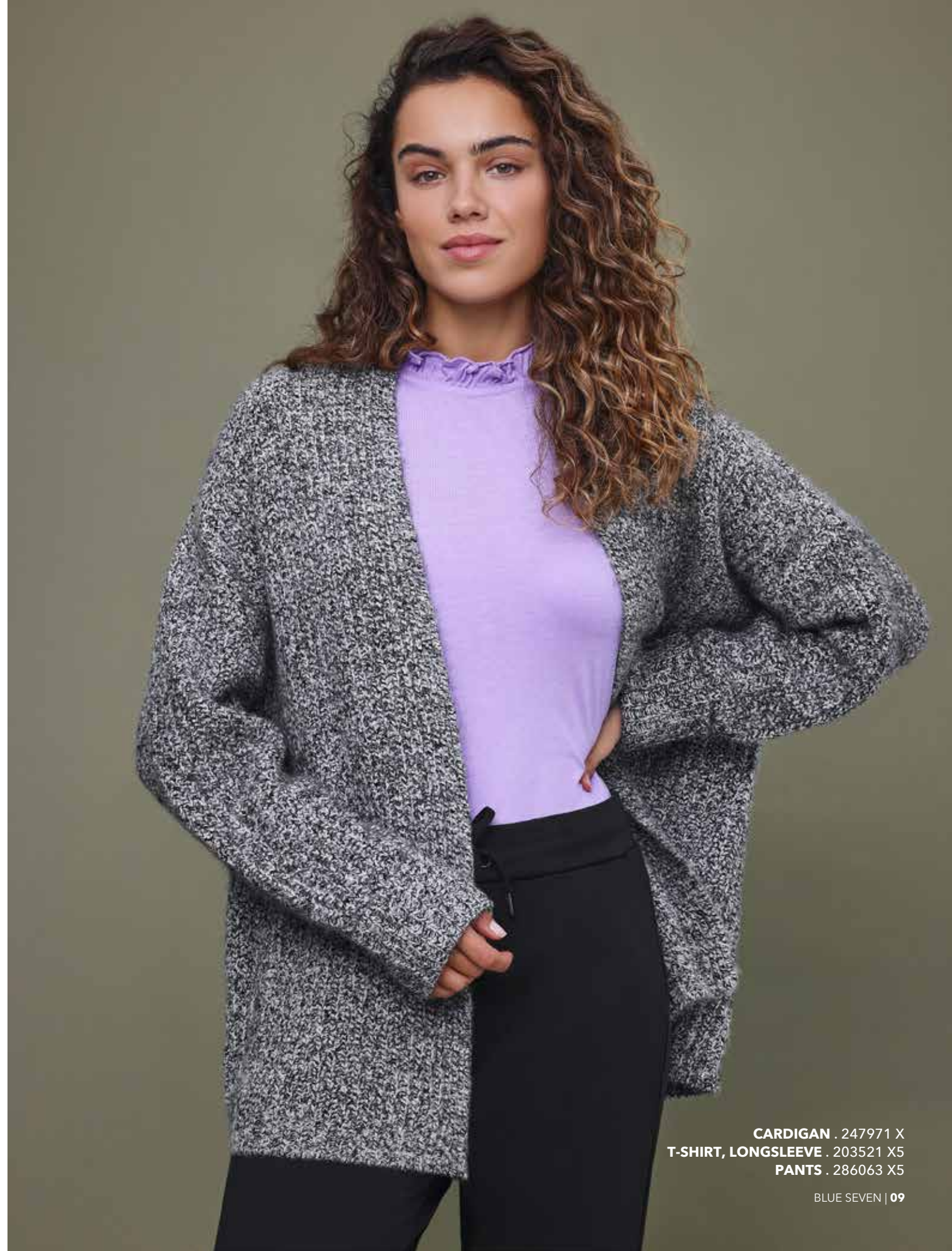
CARDIGAN . 247971 X T-SHIRT, LONGSLEEVE . 203521 X5 PANTS . 286063 X5