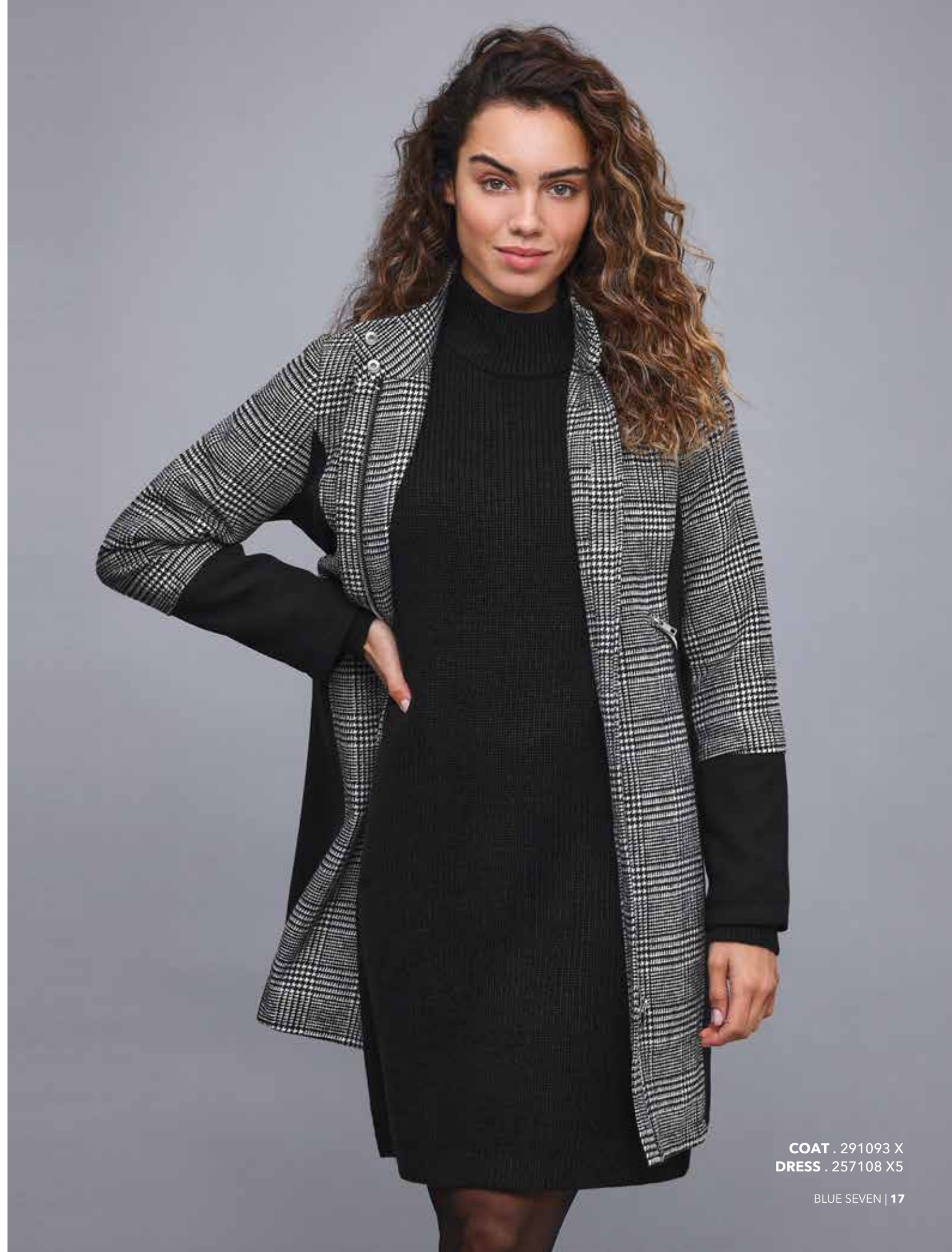
COAT . 291093 X DRESS . 257108 X5