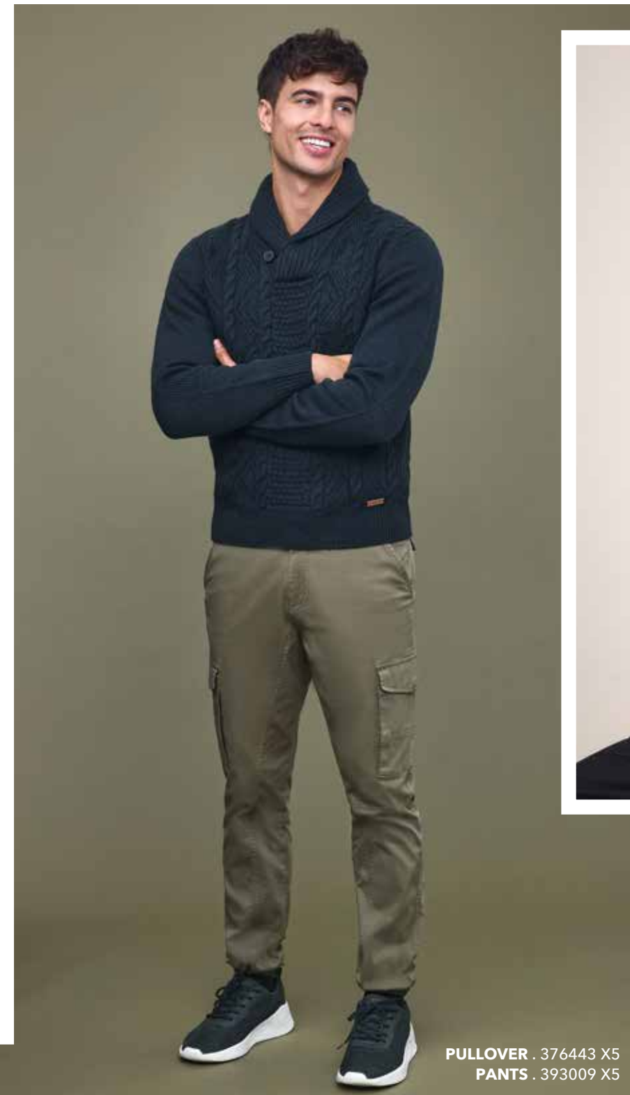
PULLOVER . 376443 X5 PANTS . 393009 X5