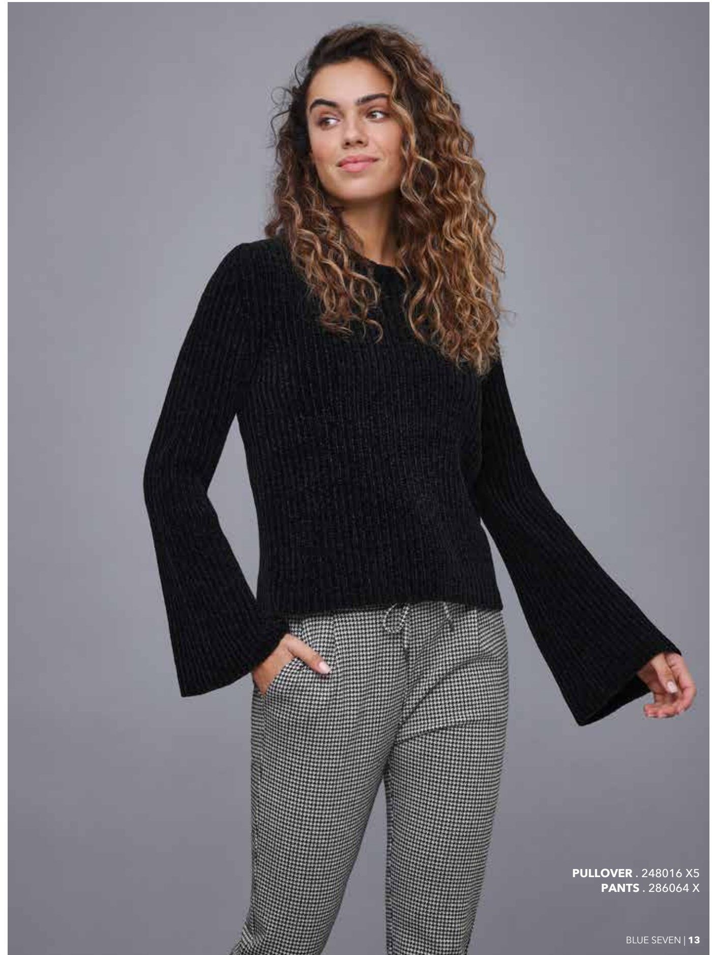
PULLOVER . 248016 X5 PANTS . 286064 X