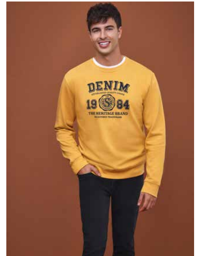
SWEATSHIRT . 370160 X5 T-SHIRT . 350508 X5 JEANS . 394510 X5