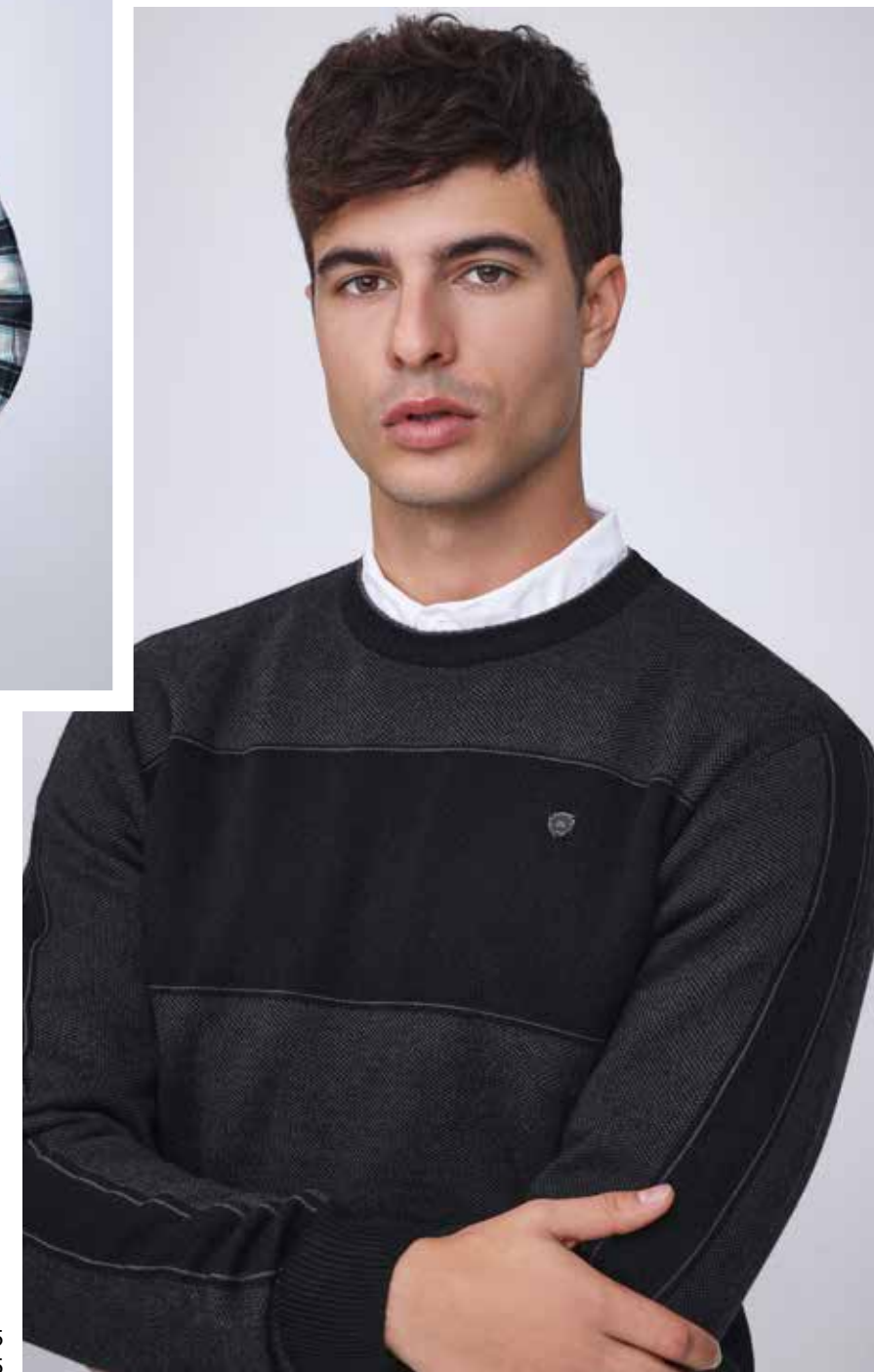
PULLOVER . 376469 X5 SHIRT . 390510 X5