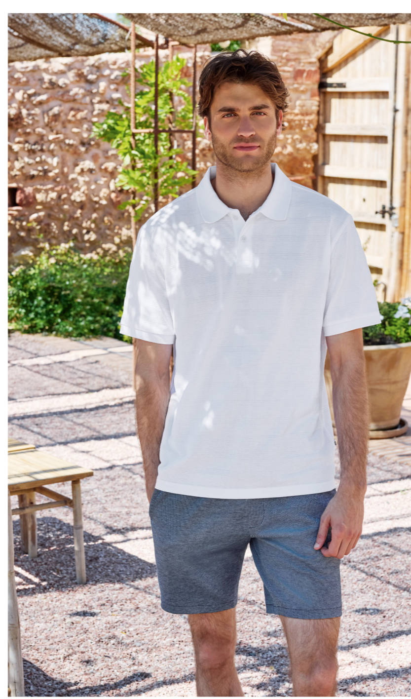
POLO . 321225 SHORTS . 333069