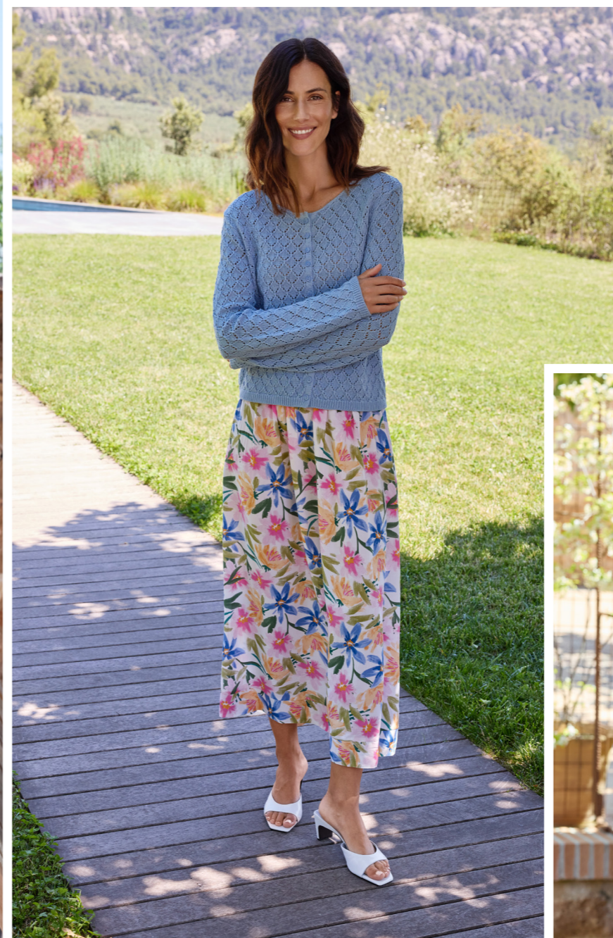
CARDIGAN . 147222 SKIRT . 182083