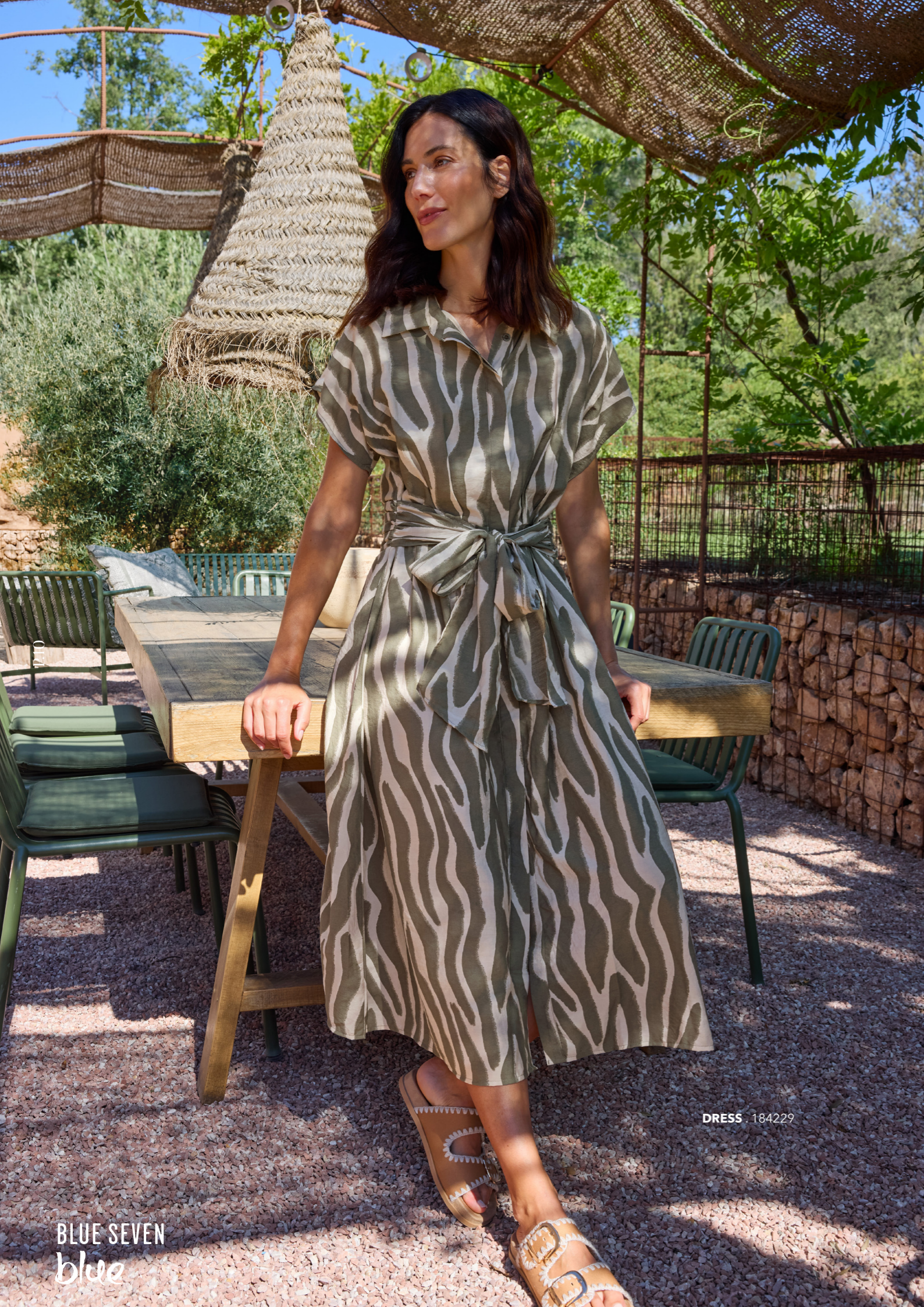
DRESS . 184229