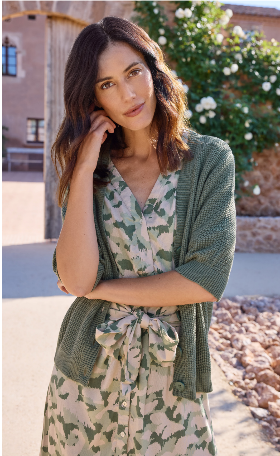
CARDIGAN . 147216 DRESS . 184234