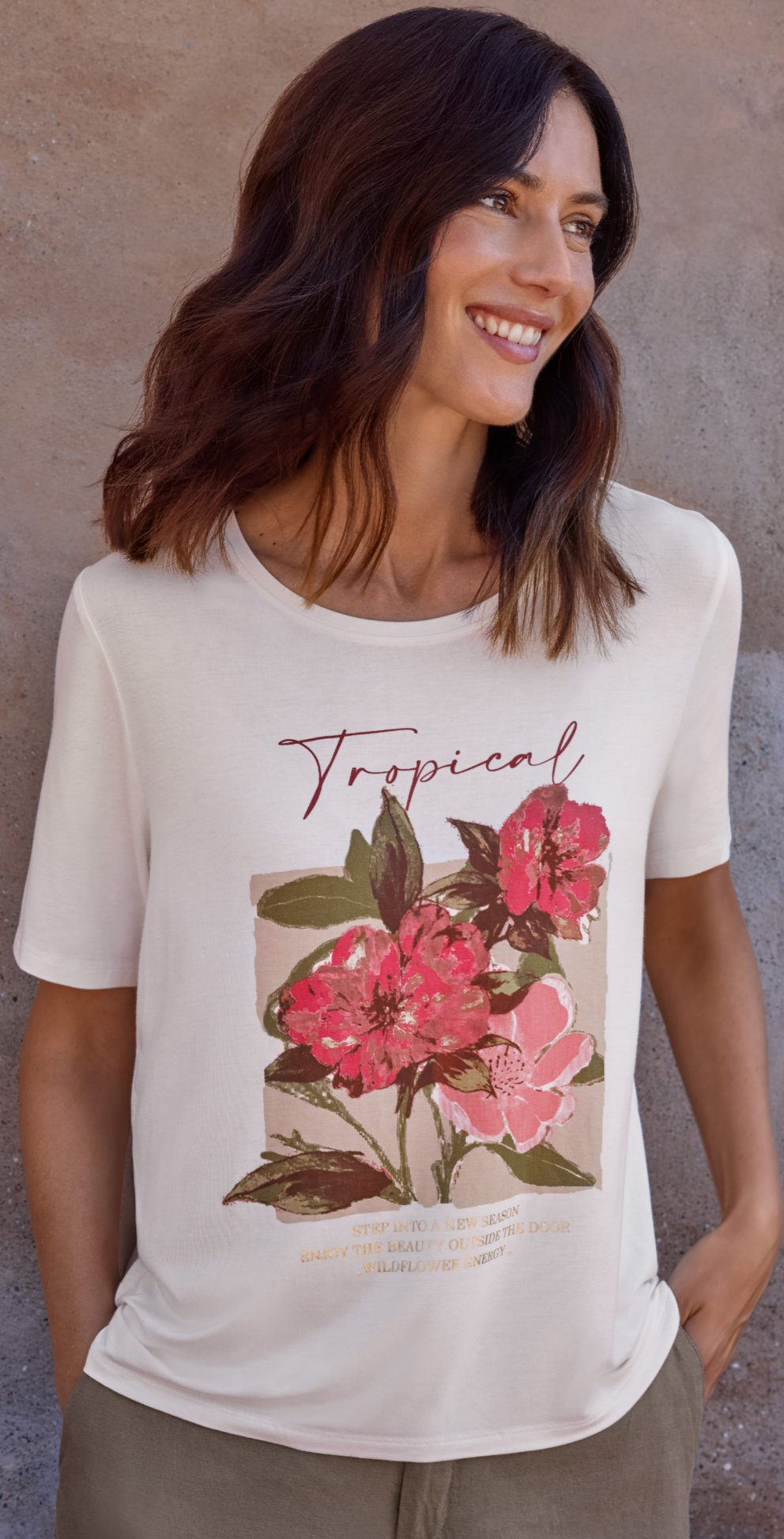
T-SHIRT . 105972 BARREL PANTS . 186233