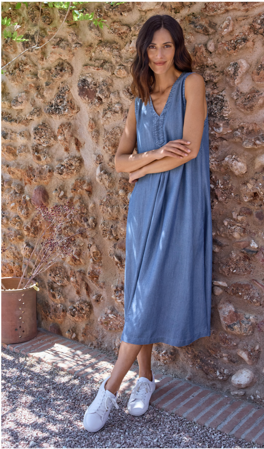
DRESS . 184239