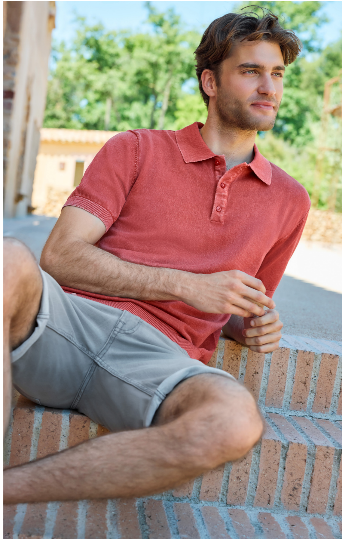
POLO . 327079 JEANS SHORTS . 345043