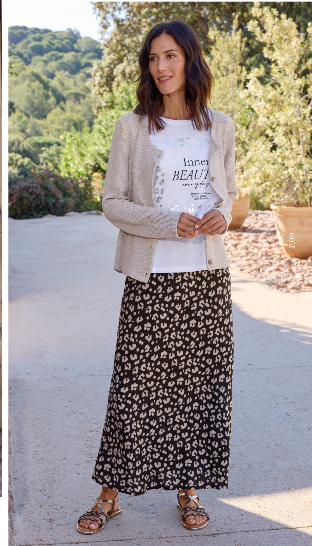
CARDIGAN . 147217 T-SHIRT . 105991 SKIRT . 182082